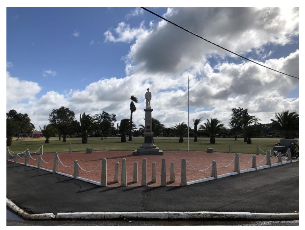
Katanning War Memorial