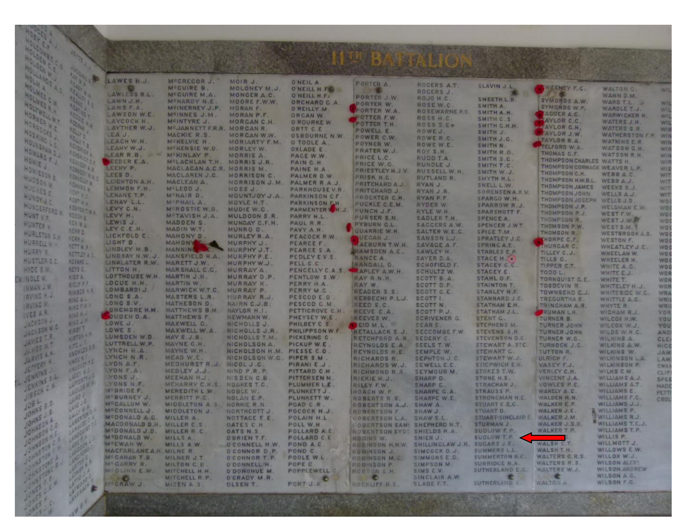
11th Battalion Roll of Honour in Crypt at King's Park, Western Australia