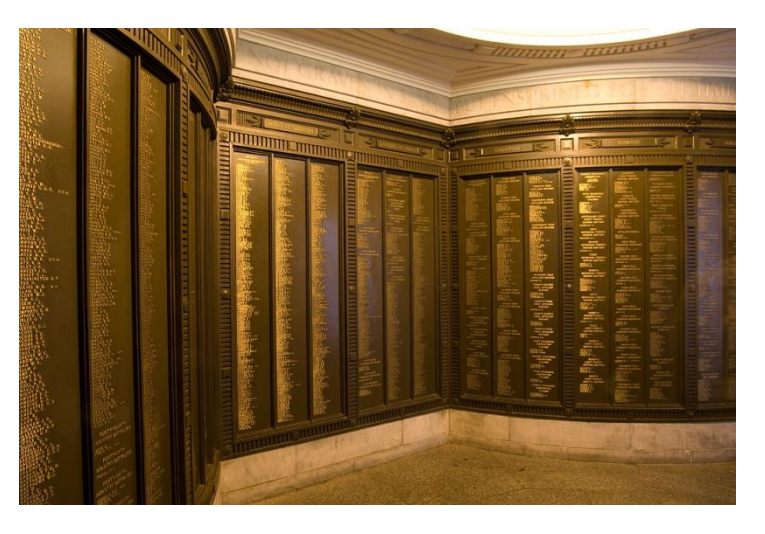
National War Memorial - Adelaide