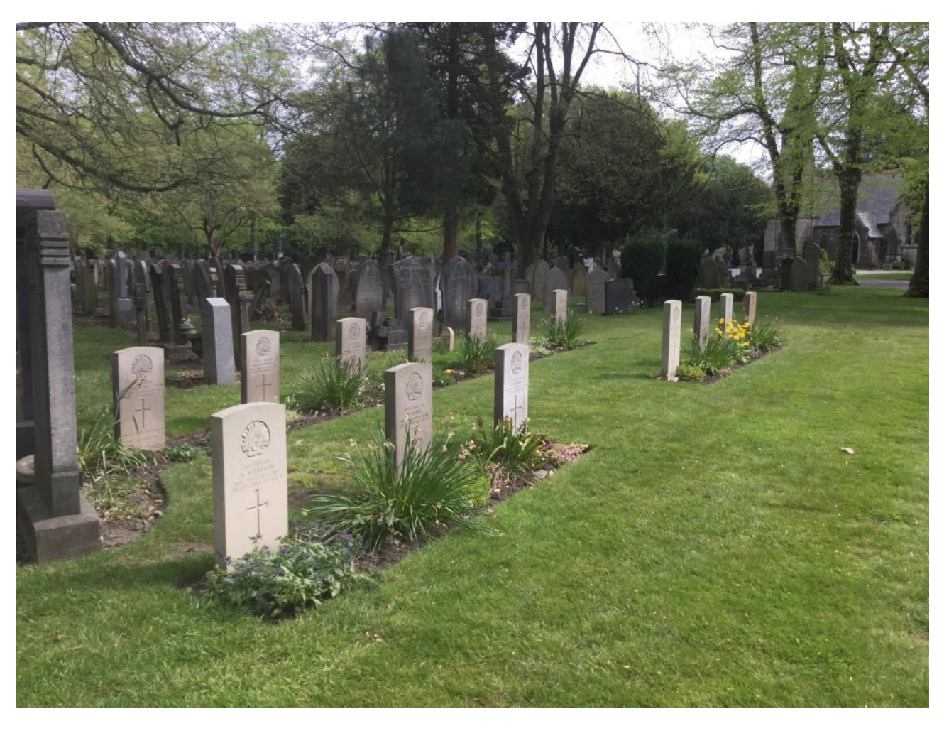
Australian Plot in Southern Cemetery, Manchester