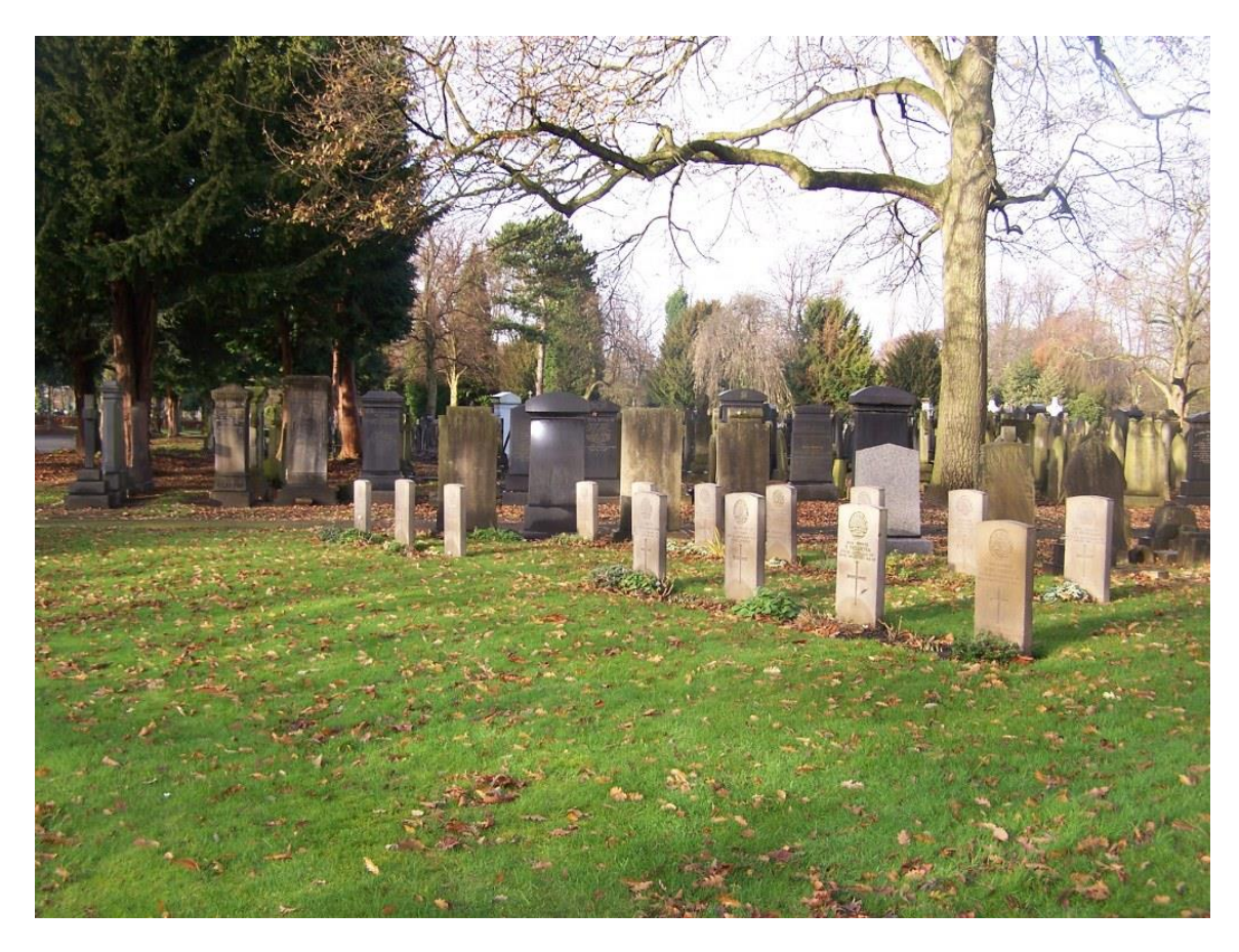
Southern Cemetery, Manchester – showing the 14 Australian War Graves from WW1