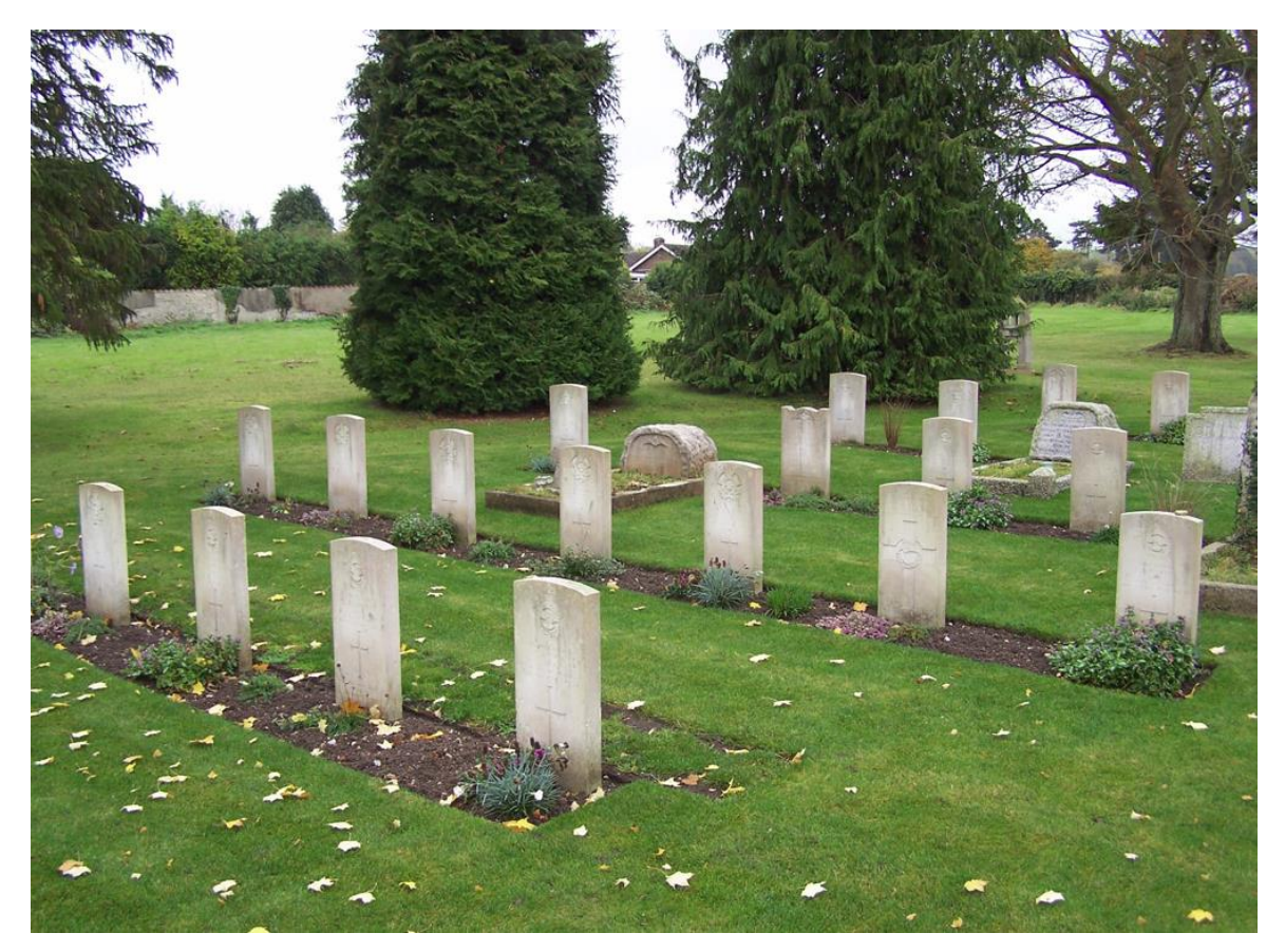
Upavon Cemetery, Upavon

Upavon Cemetery, Upavon contains 75 Commonwealth War Graves – 35 from World War 1 & 40 from World War 2. The Cemetery contains men from Canada, Australia & New Zealand as well as the United Kingdom.