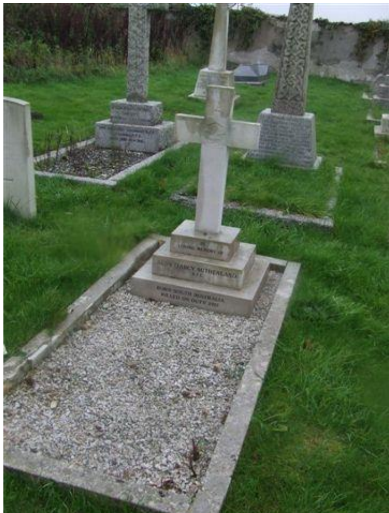
Photo of Second Lieutenant Alan D'Arcy Sutherland's Private Headstone in Upavon Cemetery, Upavon, Wiltshire, England.