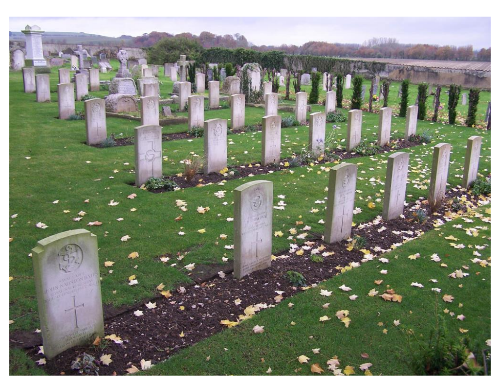
Upavon Cemetery, Upavon

Photo of Second Lieutenant Alan D'Arcy Sutherland's Private Headstone in Upavon Cemetery, Upavon, Wiltshire, England.