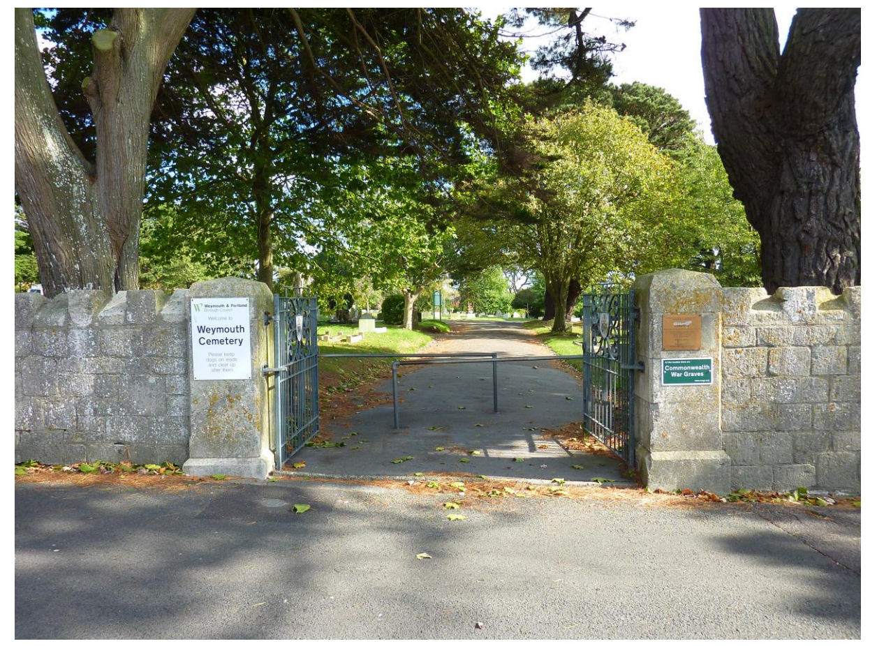
Weymouth Cemetery, Weymouth

Weymouth Cemetery contains 78 Commonwealth War Graves – 63 from World War 1 & 15 from World War 2.