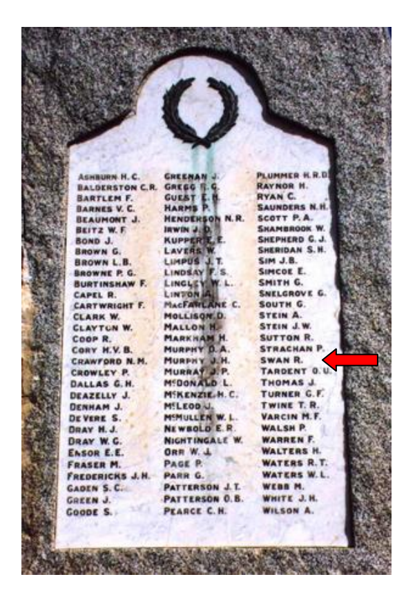
Roma War Memorial