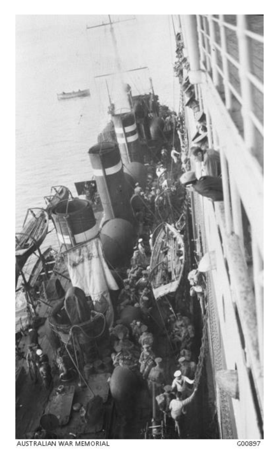
At Sea. 25 April 1915.

Men of the 1st Australian Infantry Battalion transferring from the Minnewaska to the destroyer, Scourge, about 8 a.m. on the first day of the Gallipoli landings.