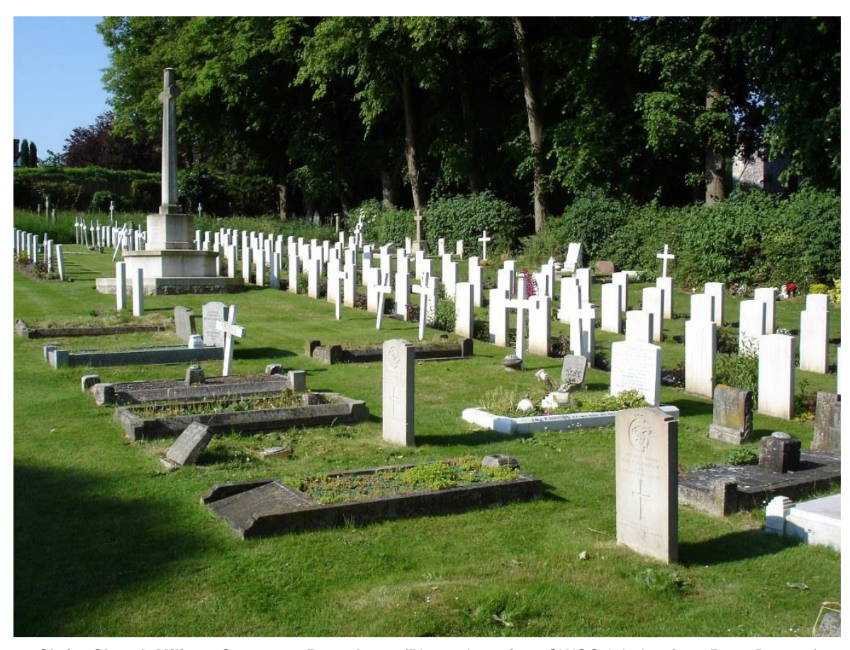
Christ Church Military Cemetery, Portsdown

Christ Church Military Cemetery, Portsdown contains 167 Commonwealth War Graves - 133 from World War 1. including 2 from Belgian Army & 34 relating to World War 2. There are 6 Australian World War 1 War Graves.