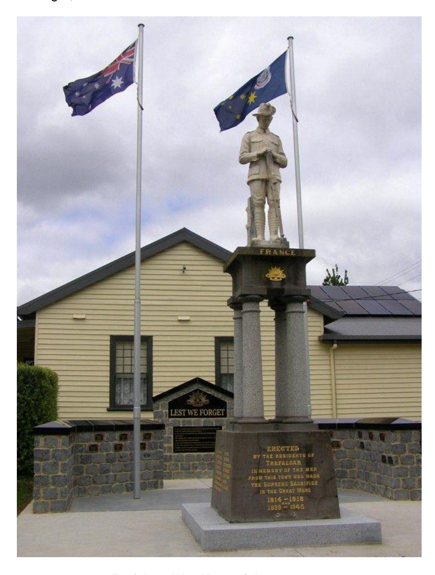
Trafalgar War Memorial