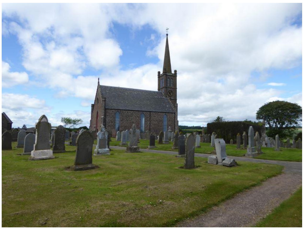
St. Cyrus Upper Parish Churchyard

St. Cyrus Upper Parish Churchyard contains only 3 Commonwealth War Graves relating to World War 1.