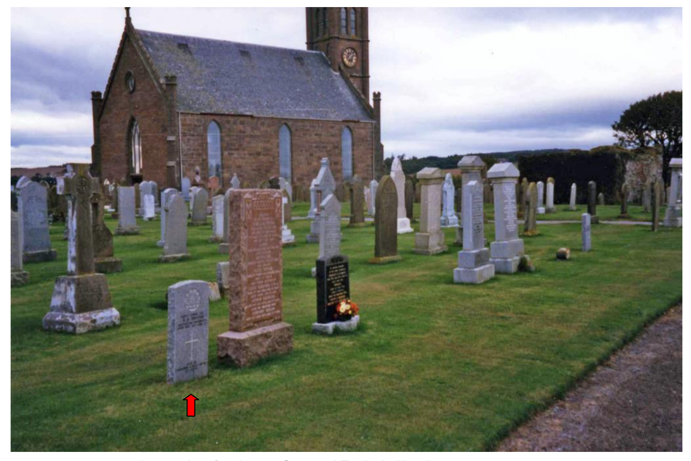
Arrow showing Lance Corporal Taylor's Headstone.