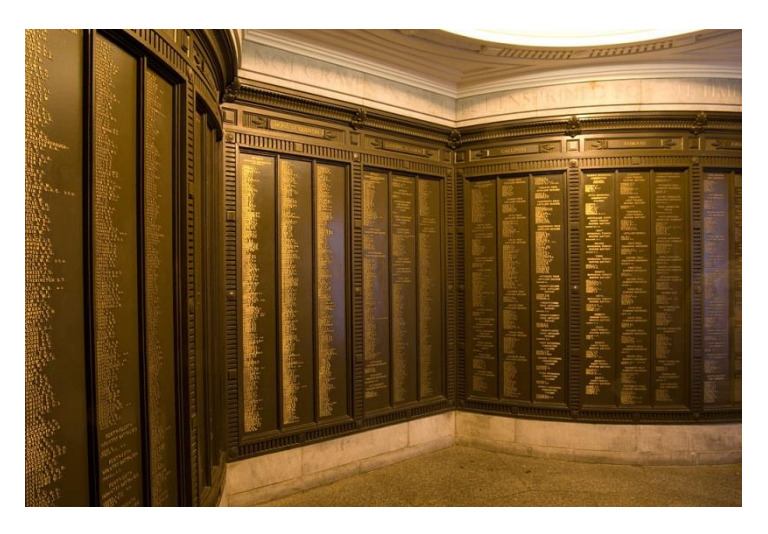
National War Memorial - Adelaide