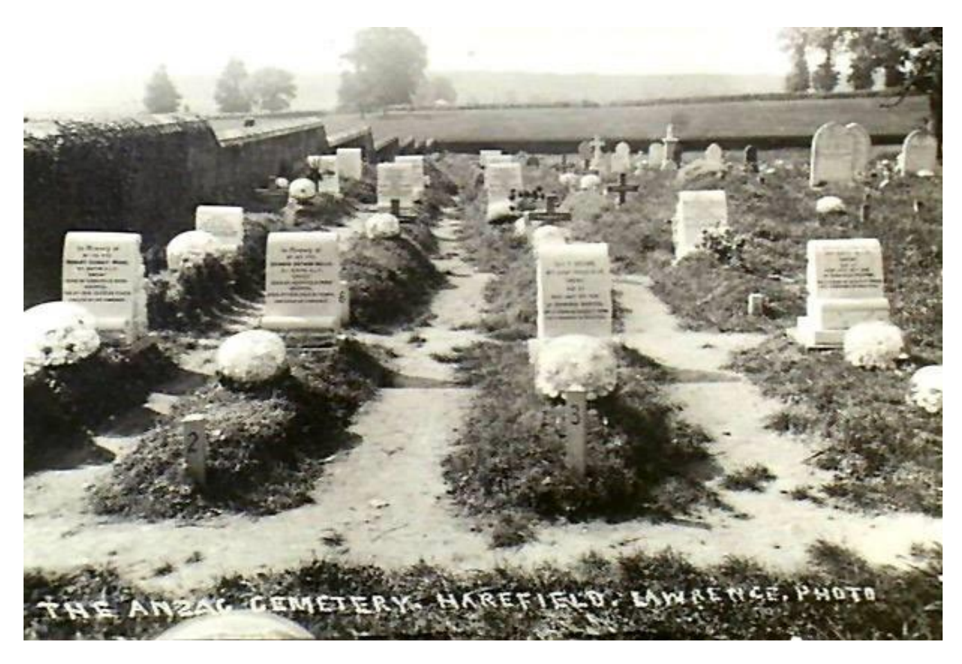
St. Mary the Virgin Churchyard, Harefield, Middlesex, England c. 1918.

The Australian corner of Harefield churchyard, containing the graves of 111 AIF personnel and one nursing sister who died of wounds or illness at No. 1 Australian Auxiliary Hospital, Harefield Park. The graves have rectangular headstones with carved scrolls at top and bottom and all bear the words "Erected by his comrades" and "ANZAC".