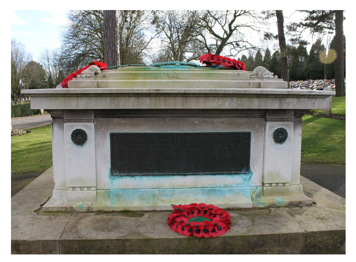
Stourbridge Cemetery Overseas Soldiers Sarcophagus/Memorial

"In Grateful Memory Of Our Comrades From Overseas Who Died In The Stourbridge Military Hospital During The Great War 1914-19."