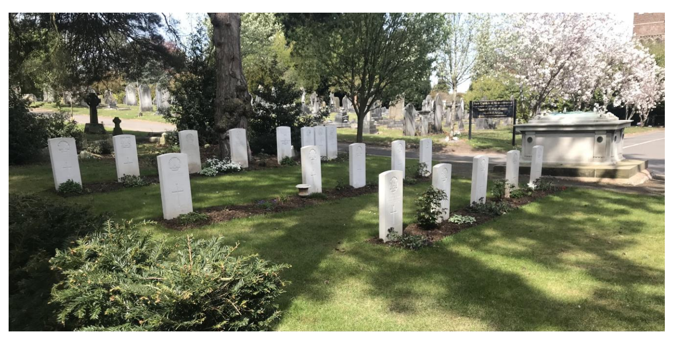
Australian Plot