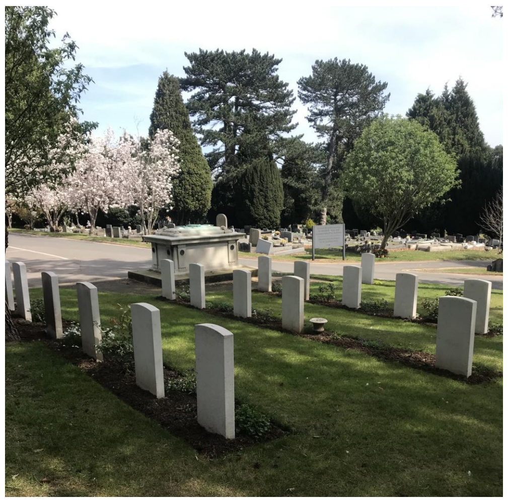
Australian Plot (Photo courtesy of Margaret Carter)

Stourbridge Cemetery showing Australian WW1 War Graves (Photo courtesy of Margaret Carter)