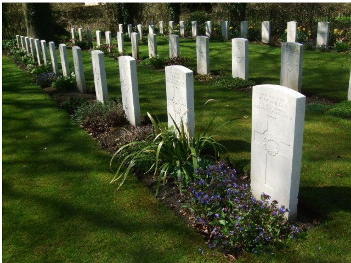
New Zealand Section of Codford Anzac War Graves Cemetery (Photo by Romy Wyeth 2013)

Codford War Graves map adapted from Brian Marshall courtesy of Romy Wyeth