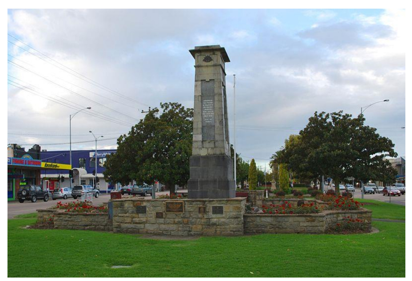
Bairnsdale Cenotaph

The Bairnsdale Cenotaph, located on median strip on Main Street (Princes Highway), near Service Street, Bairnsdale, Victoria does not list individual names.