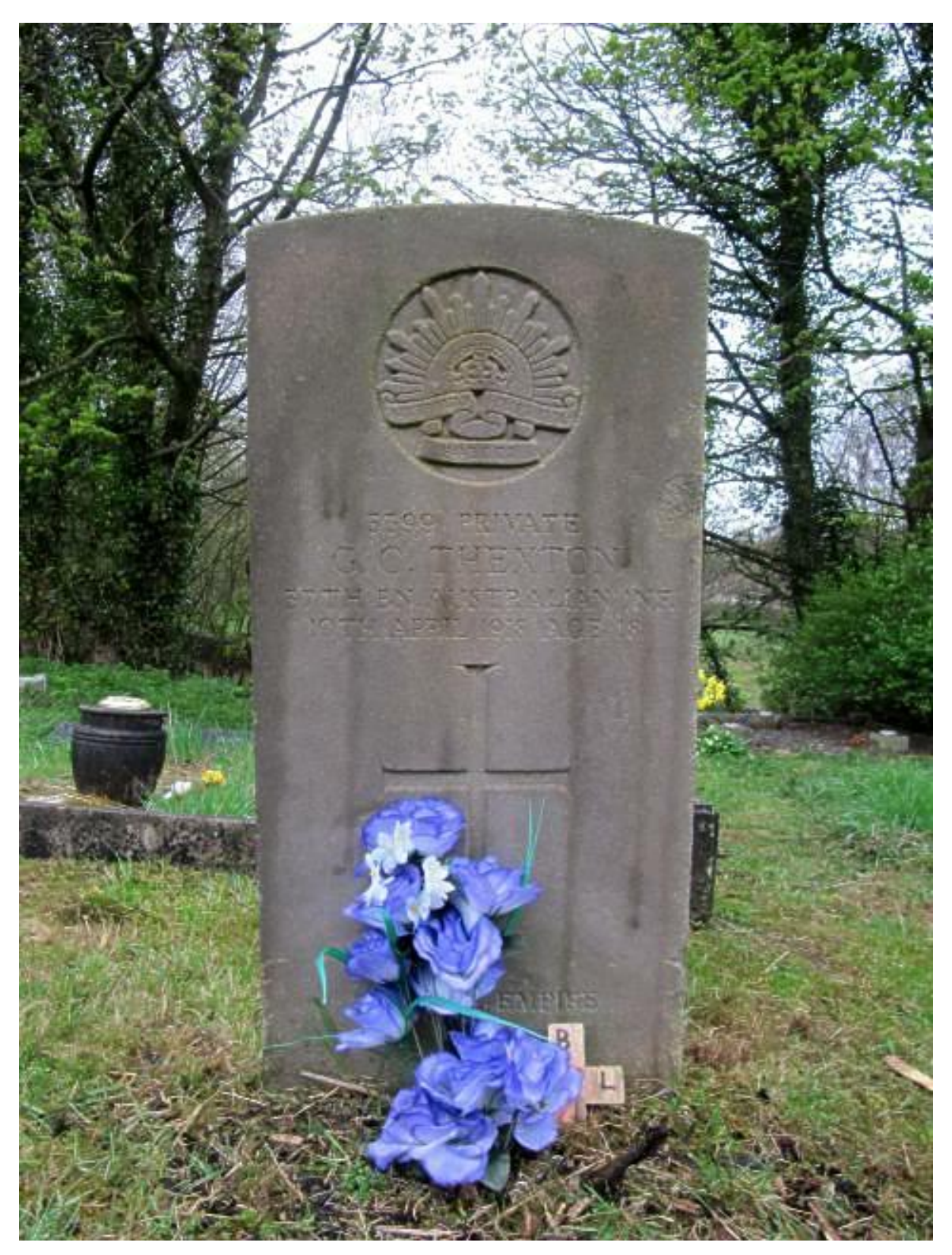
Photo of Private G. C. Thexton's Commonwealth War Graves Commission Headstone in Lancaster Cemetery, Lancashire, England.