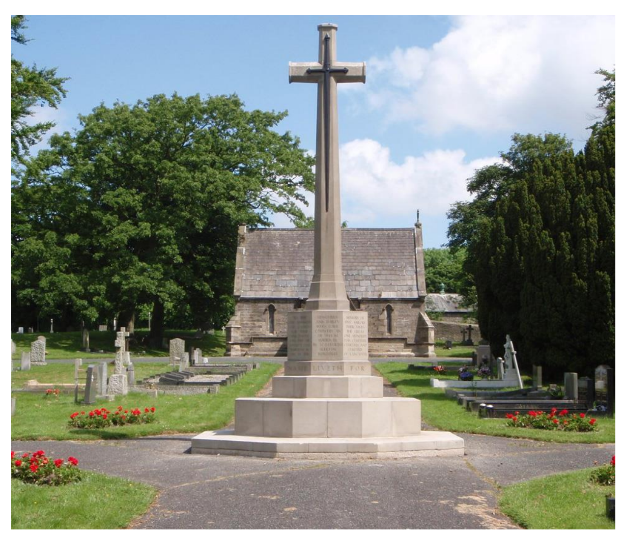
Cross of Sacrifice in Lancaster Cemetery