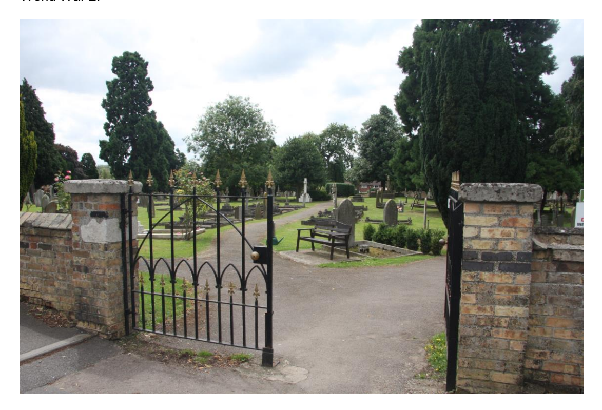
Priory Road Cemetery, Huntingdon

Priory Road Cemetery, Huntingdon contains 28 Commonwealth War Graves – 20 relating to World War 1 & 8 from World War 2.