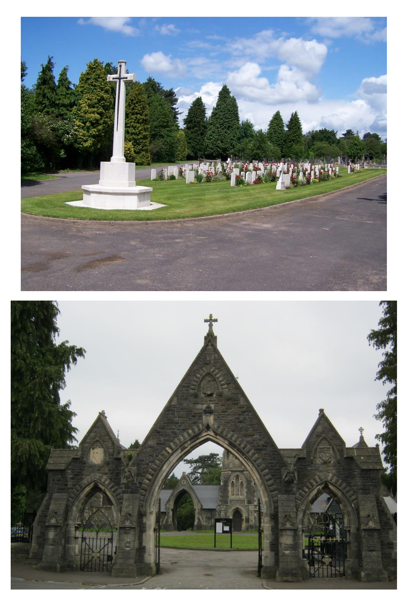
Entrance to Cathays Cemetery