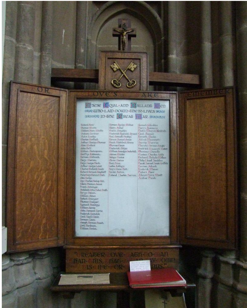
St. Peter's Church, Wolverhampton Roll of Honour

Arthur Stanley Thomas is remembered on the Word War 1 Roll of Honour located in St. Peter's Church, Wolverhampton, England.