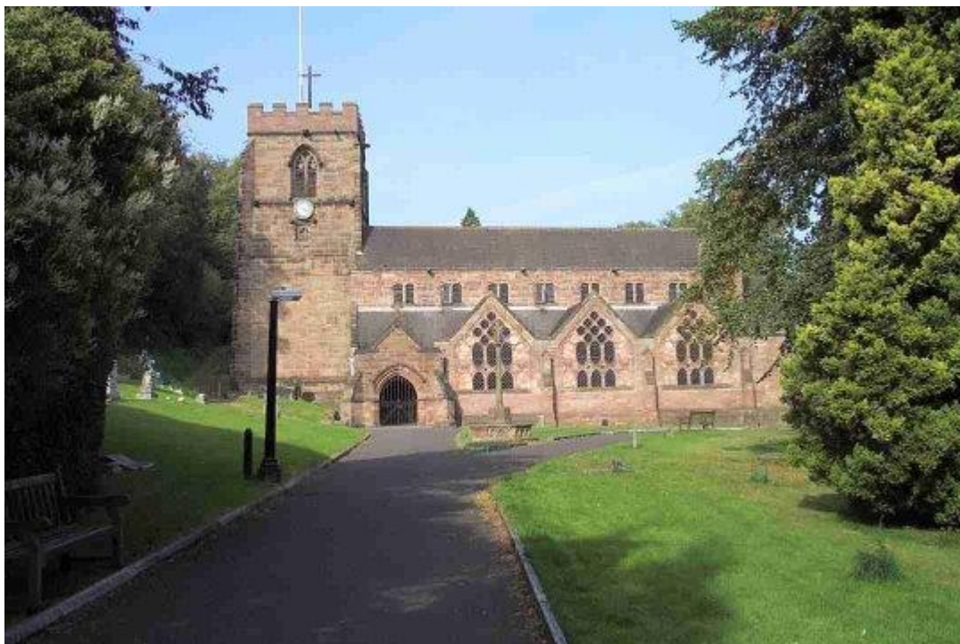
St. Michael and All Angels Church, Tettenhall Regis

St. Michael's Churchyard, Tettenhall Regis, Wolverhampton, Staffordshire contains 25 Commonwealth War Graves – 15 relating to the First World War & 10 relating to the Second World War.