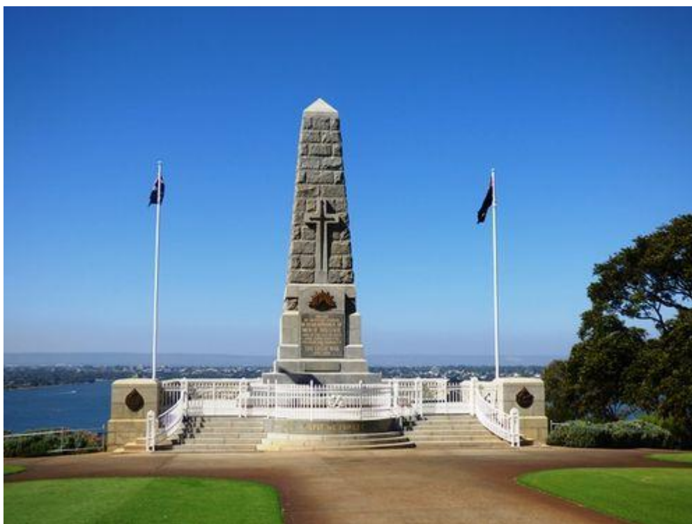
Western Australia State War Memorial Cenotaph, Kings Park (above)

The heavy concrete foundations are supplemented by heavy brick walls which enclose an inner chamber or crypt. The walls surrounding the crypt are covered with The Roll of Honour; marble tablets which list under their units the names of more than 7,000 members of the services killed in action or as a result of World War One.