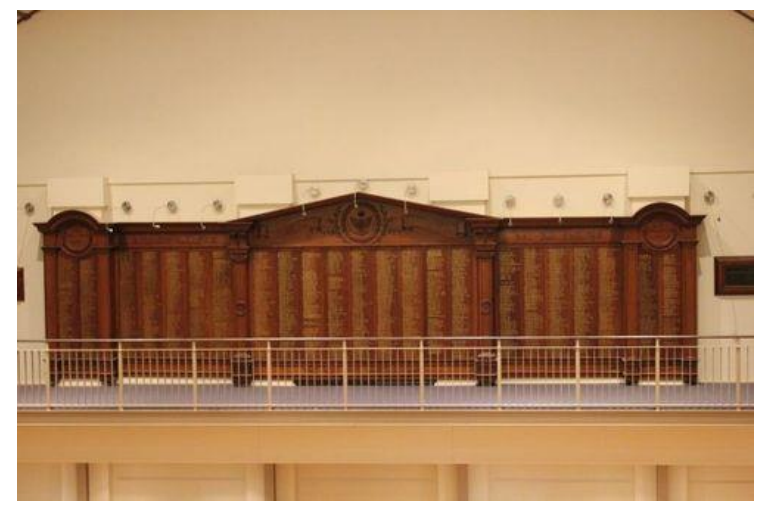
Unley City Honour Roll

W. G. Thomas is remembered on the Unley City Honour Roll, located at Town Hall, Unley Road & Oxford Terrace, Unley, South Australia.