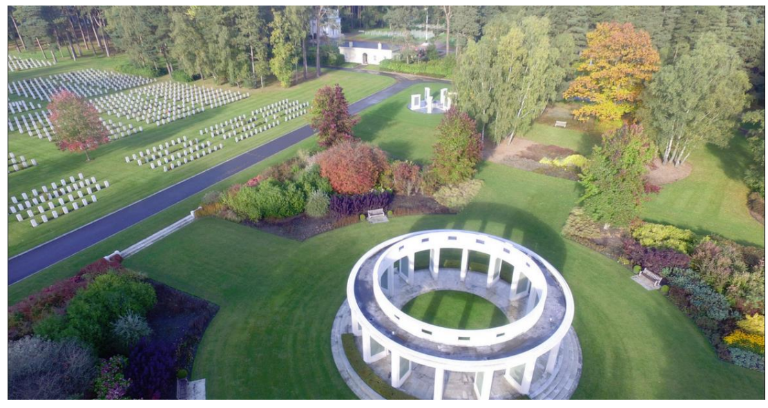
Brookwood Military Cemetery

There are 446 Australian War Graves in Brookwood Military Cemetery – 351 from World War 1 & 95 from World War 2.