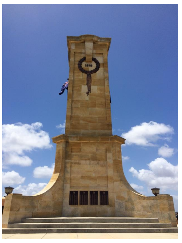
Fallen Sailors & Soldiers Memorial