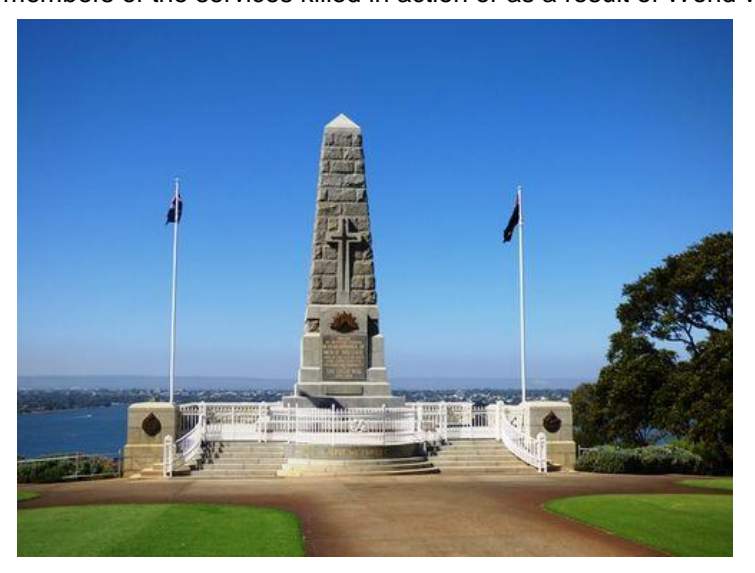
Western Australia State War Memorial Cenotaph, Kings Park (above) & (below) The Crypt with the Roll of Honour names

The heavy concrete foundations are supplemented by heavy brick walls which enclose an inner chamber or crypt. The walls surrounding the crypt are covered with The Roll of Honour; marble tablets which list under their units the names of more than 7,000 members of the services killed in action or as a result of World War One.