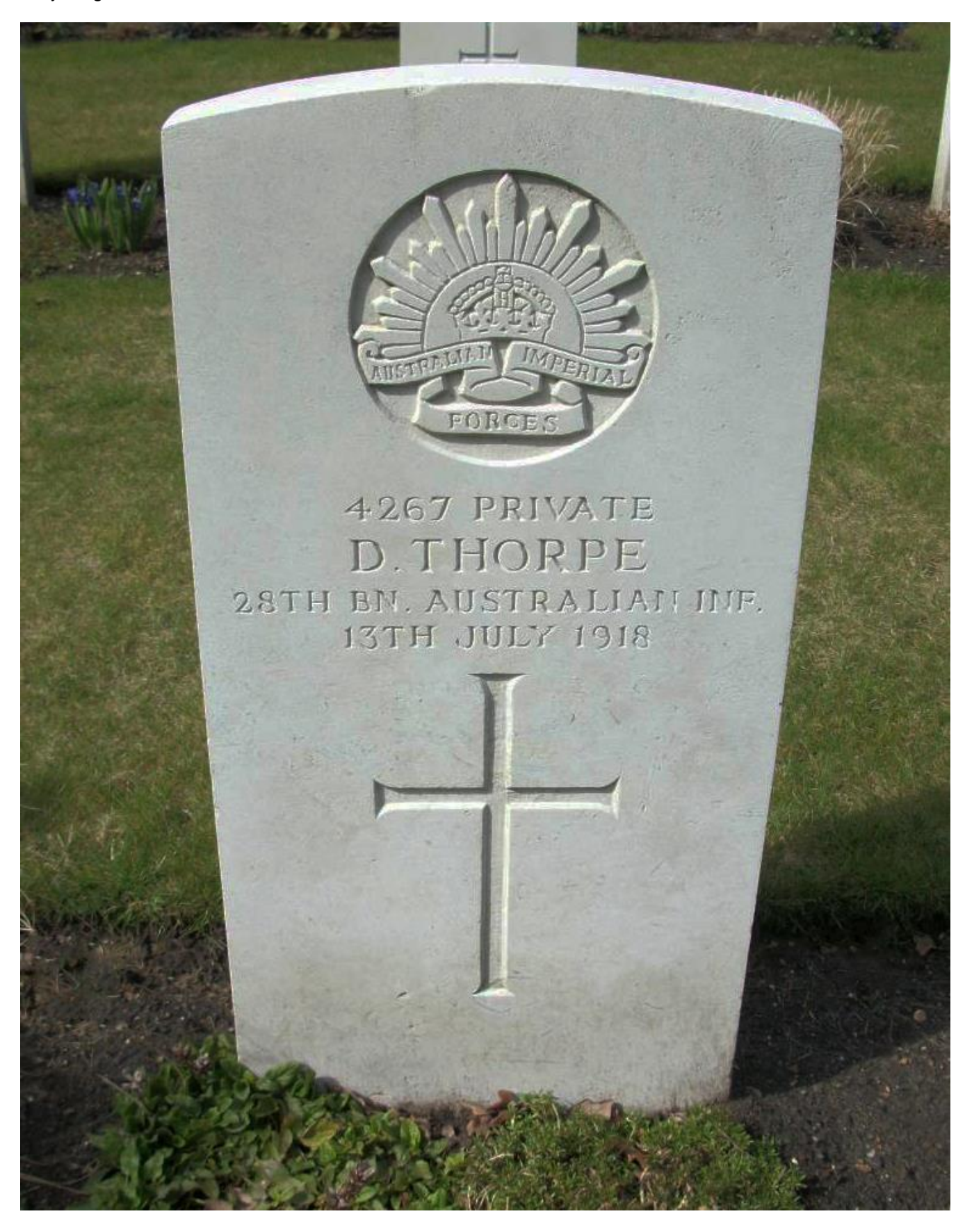
Photo of Private D. Thorpe's Commonwealth War Graves Commission Headstone in Brookwood Military Cemetery, Surrey, England.