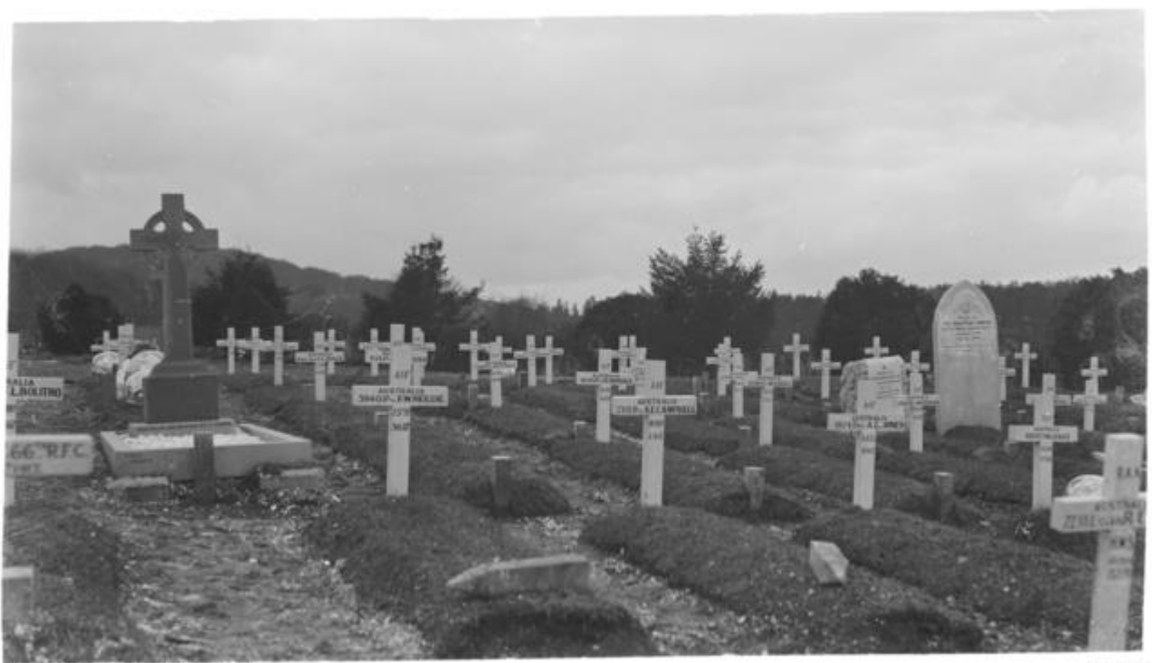
AUSTRALIAN WAR MEMORIAL DO0481