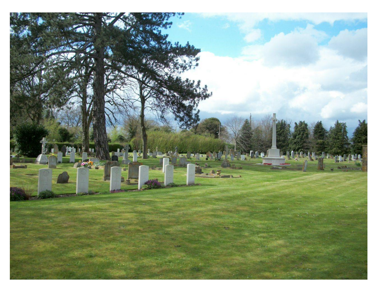
Bulford Church Cemetery