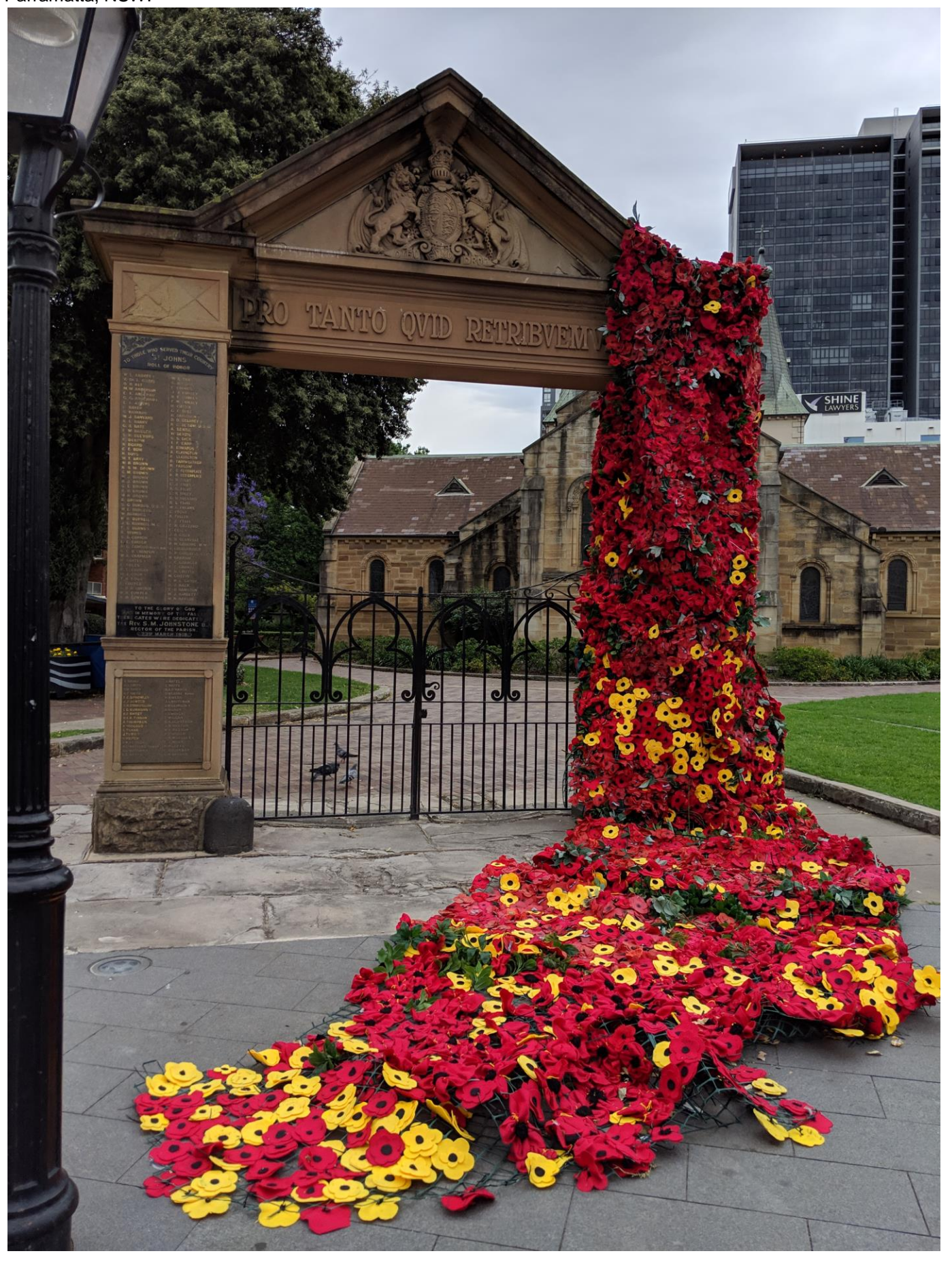
St. John's Anglican Cathedral Memorial Arch