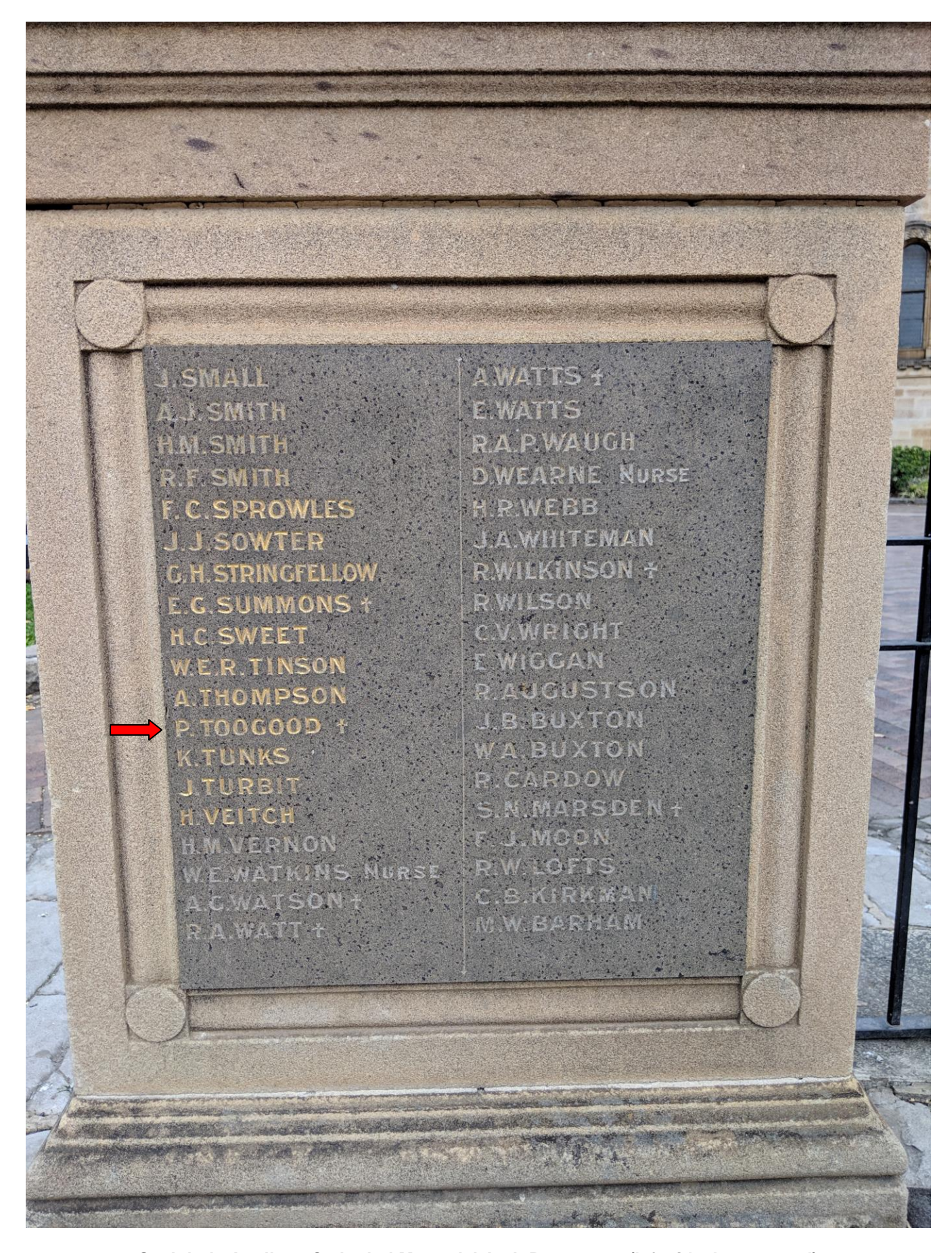
St. John's Anglican Cathedral Memorial Arch Parramatta (left side, lower panel)