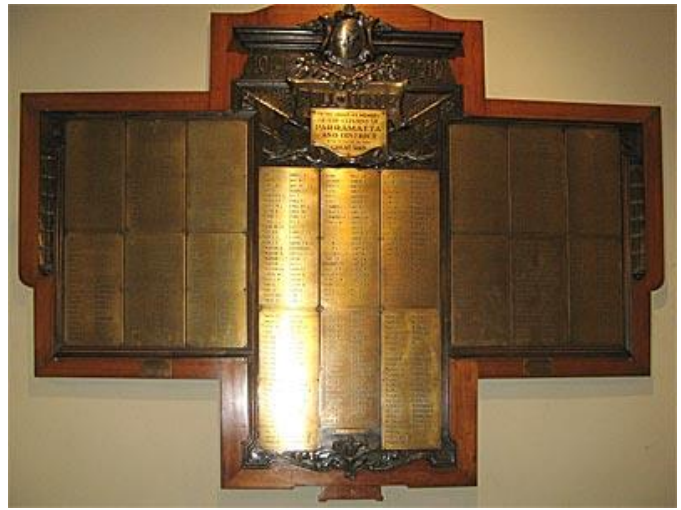
Parramatta and District Great War Roll of Honour