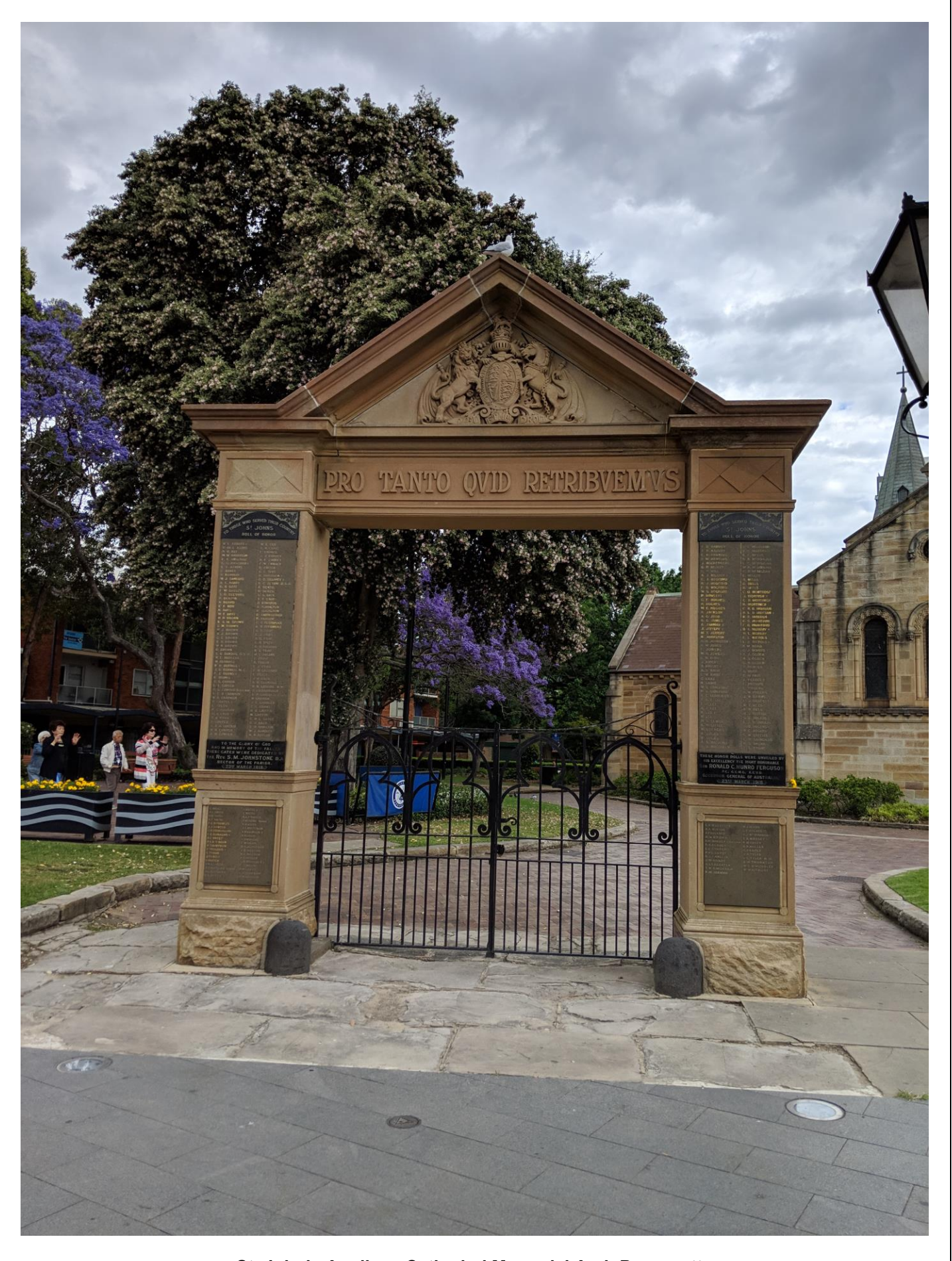
St. John's Anglican Cathedral Memorial Arch Parramatta