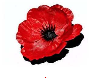
Lest We Forget