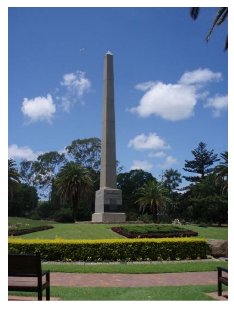
Rockhampton War Memorial

The Rockhampton War Memorial, located in Botanic Gardens, 100 Spencer Street, Rockhampton, Queensland, does not contain any individual names.