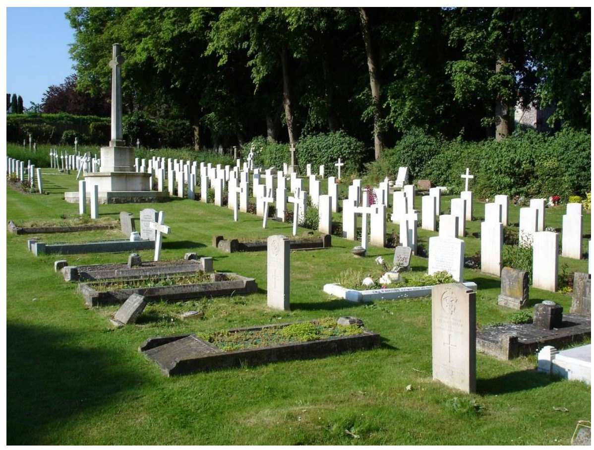
Christ Church Military Cemetery, Portsdown

Christ Church Military Cemetery, Portsdown contains 167 Commonwealth War Graves - 133 from World War 1. including 2 from Belgian Army & 34 relating to World War 2. There are 6 Australian World War 1 War Graves.