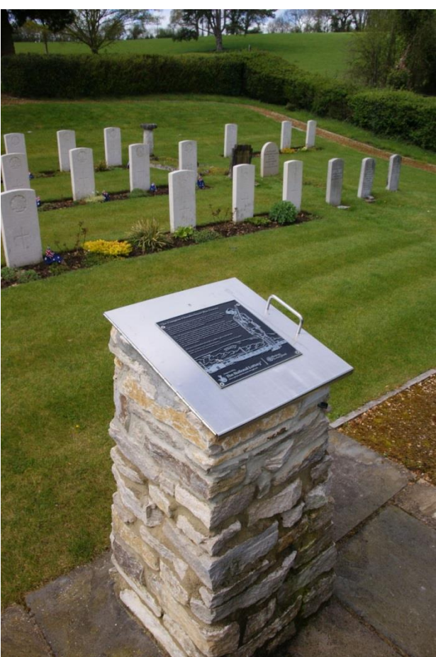
Left & right of Cemetery with central Plinth