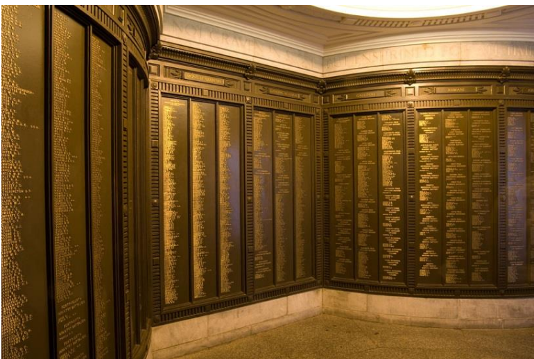
National War Memorial - Adelaide