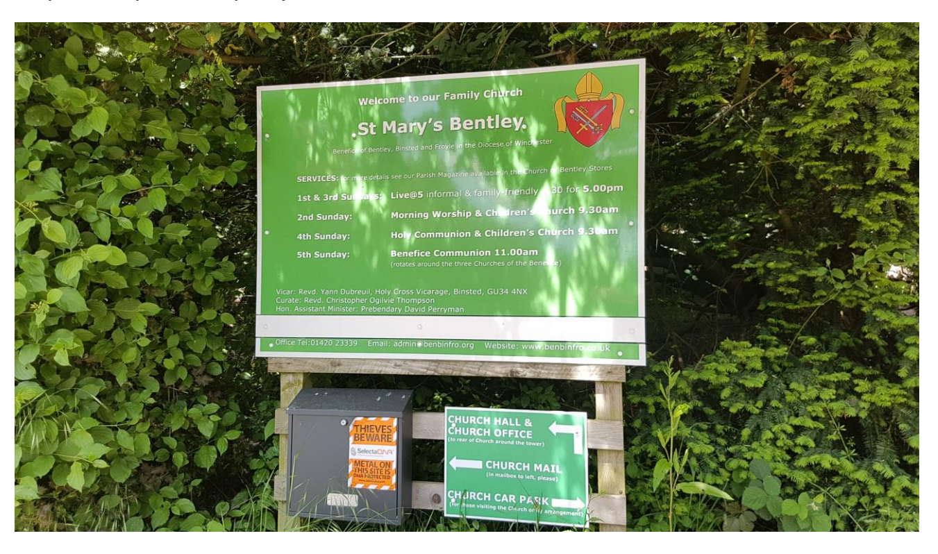
St. Mary's Church, Bentley

St. Mary's Churchyard, Bentley has just two Commonwealth War Graves – both from World War 1.