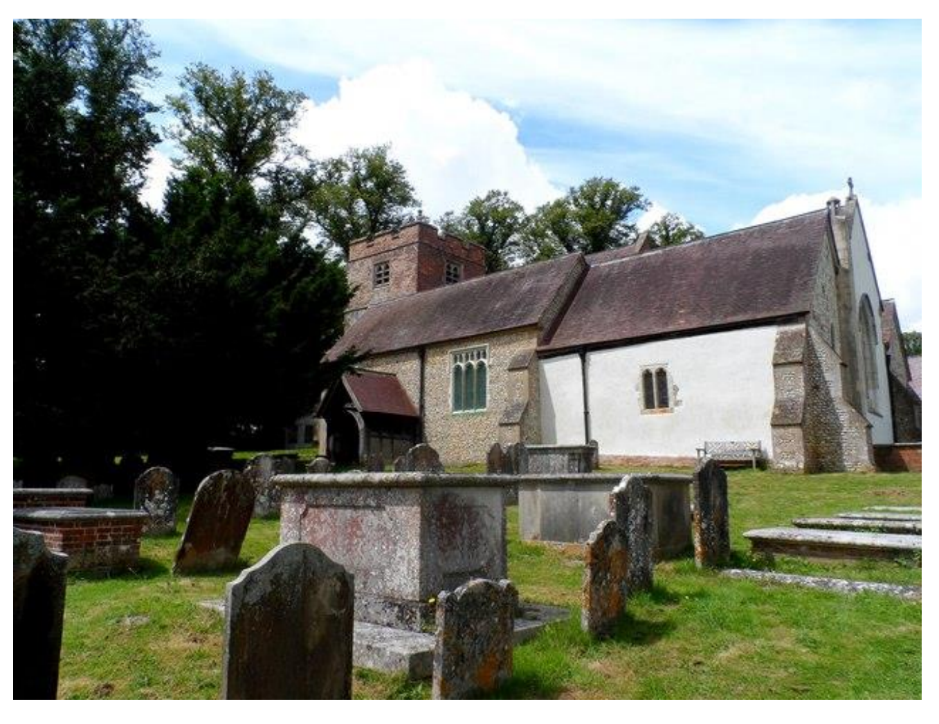
St. Mary's Church, Bentley