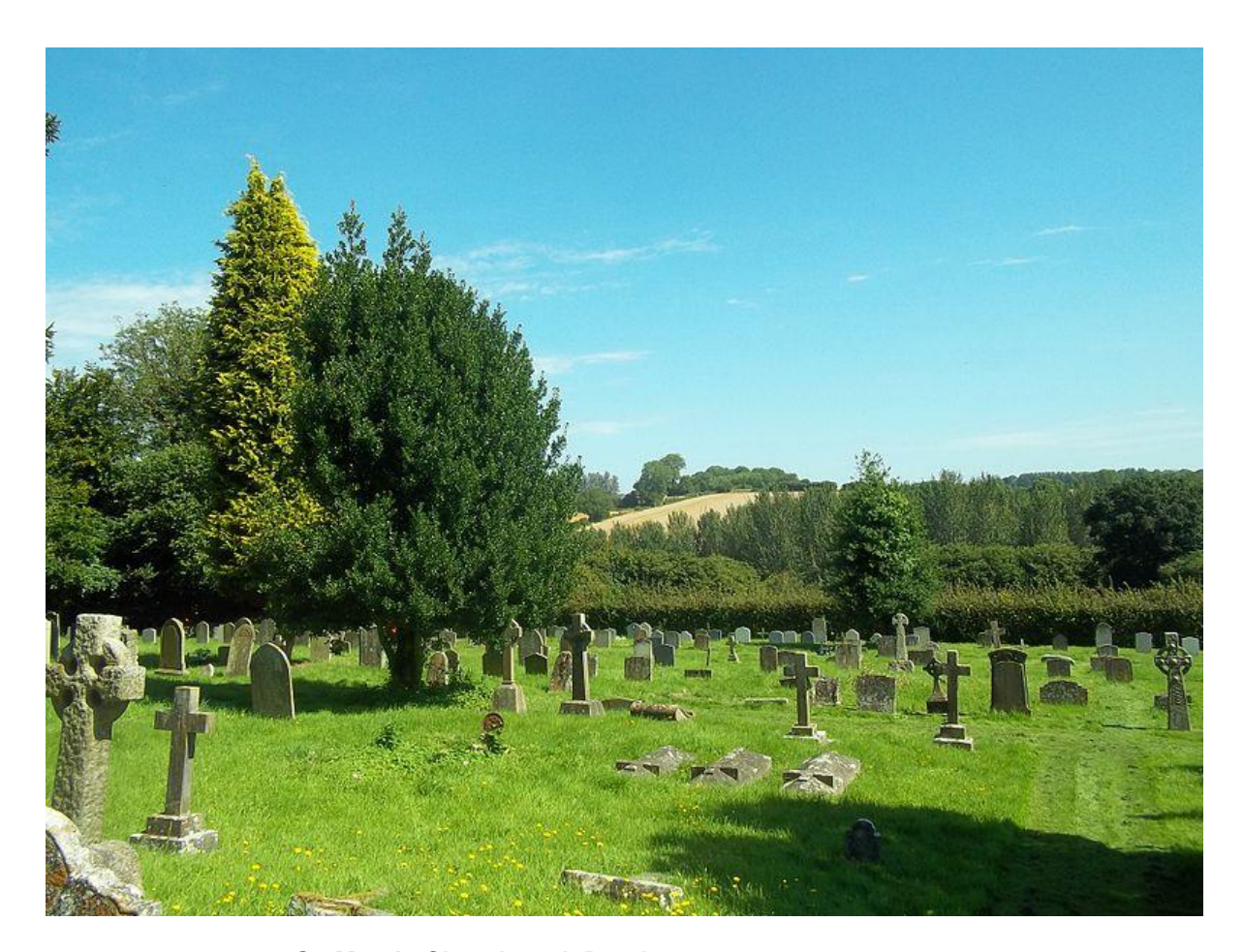
St. Mary's Churchyard, Bentley