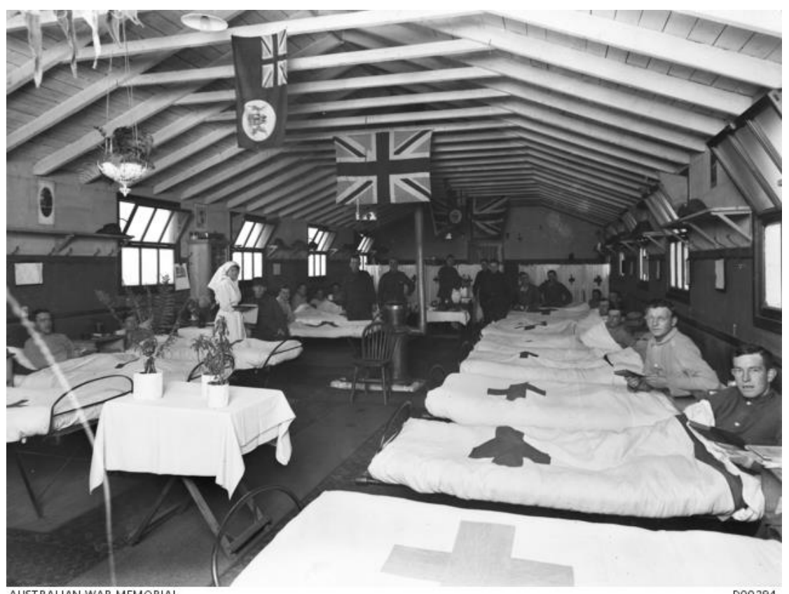
AUSTRALIAN WAR MEMORIAL