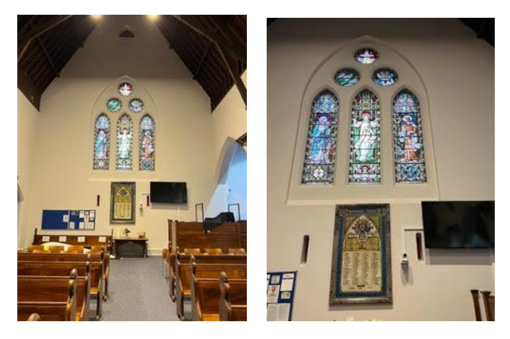
Caulfield Anglican Church Roll of Honour