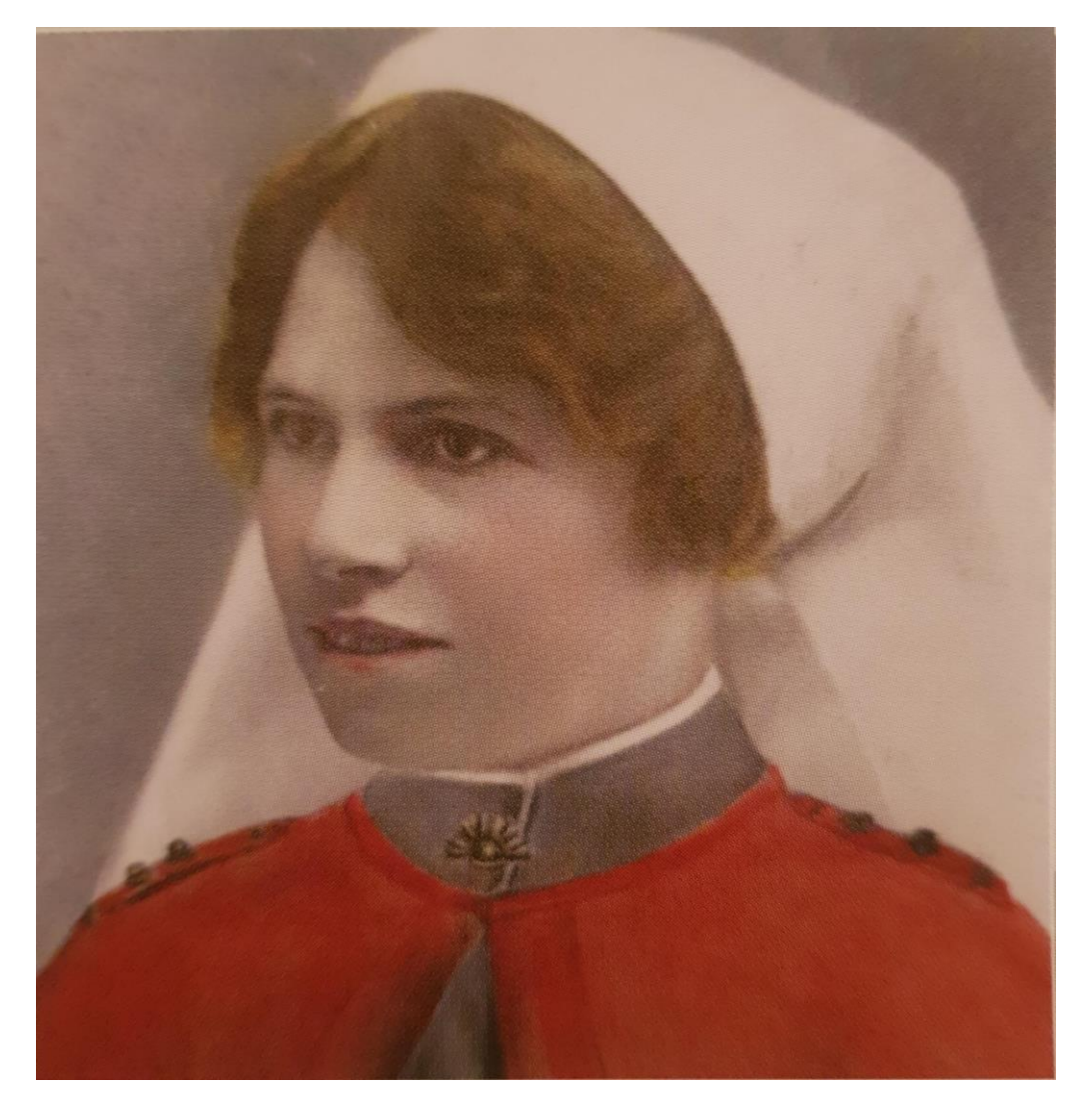
Family photo believed to be taken when she had just finished her training in Victoria.