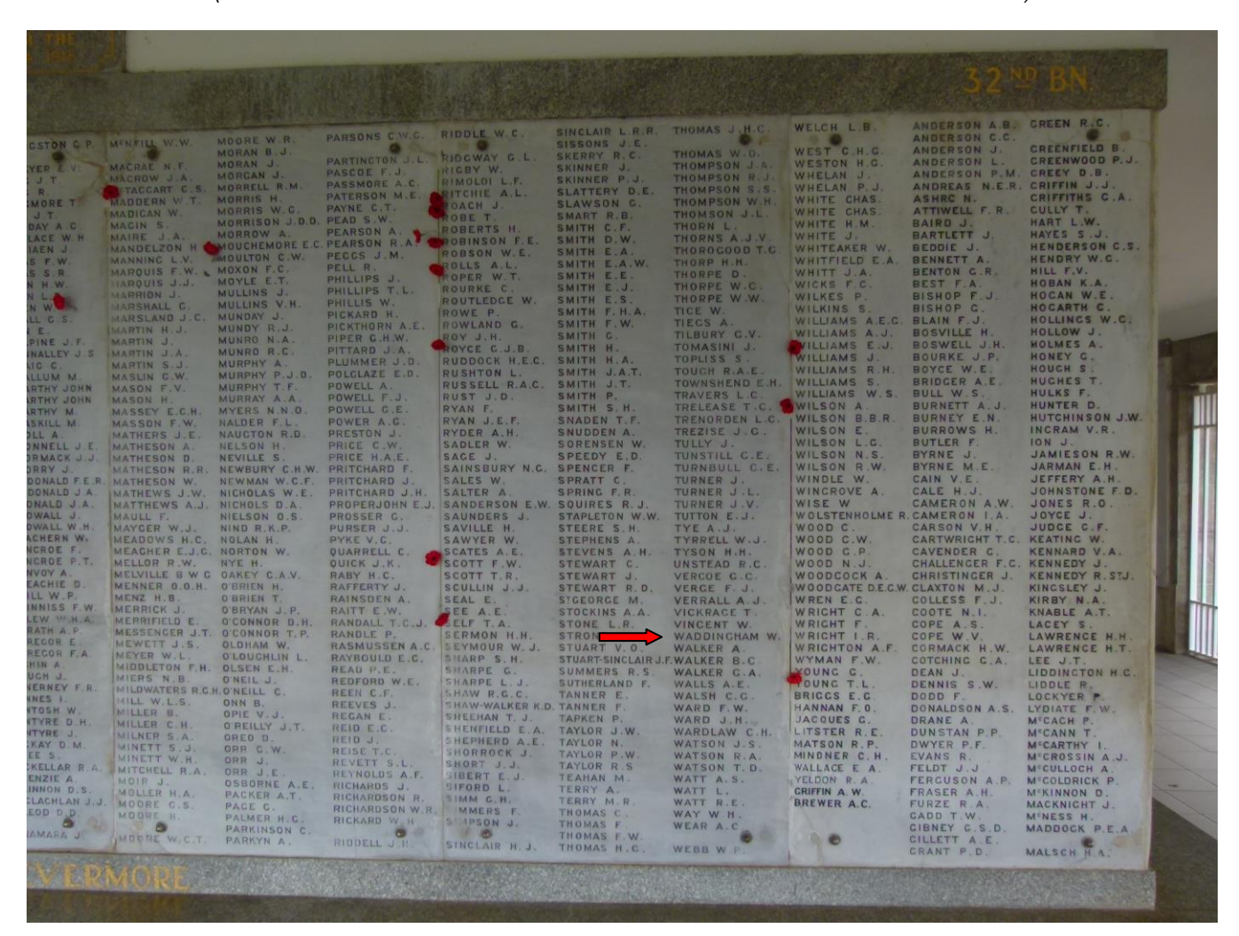
28th Battalion Panel