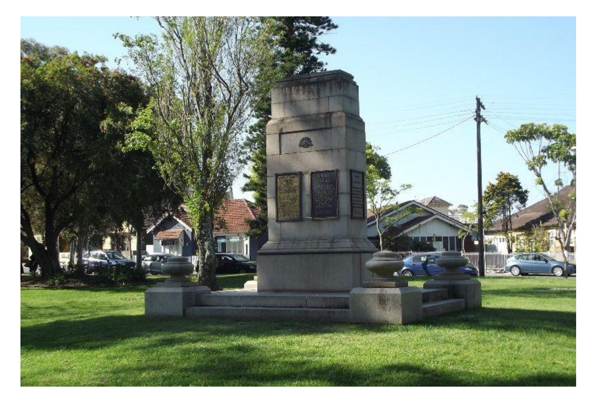
Randwick District War Memorial

The Randwick District War Memorial, located in High Cross Park, Cuthill & Avoca Streets & Belmore Road, Randwick, NSW, does not list individual names.