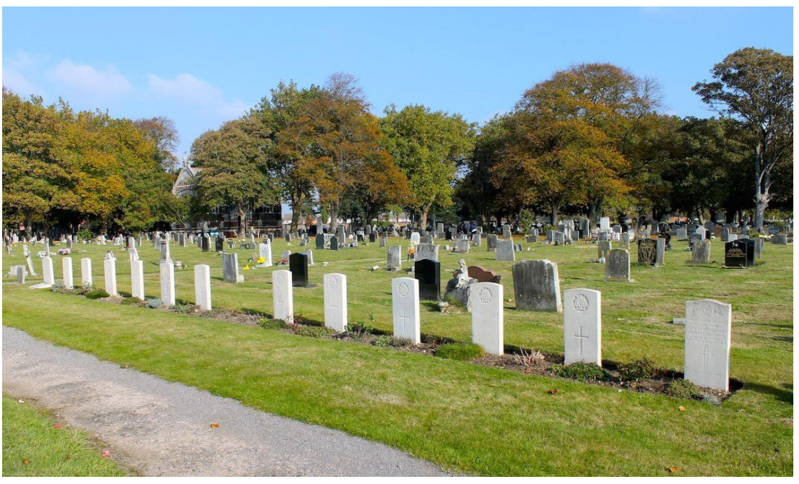
Australian War Graves in Milton Cemetery, Portsmouth