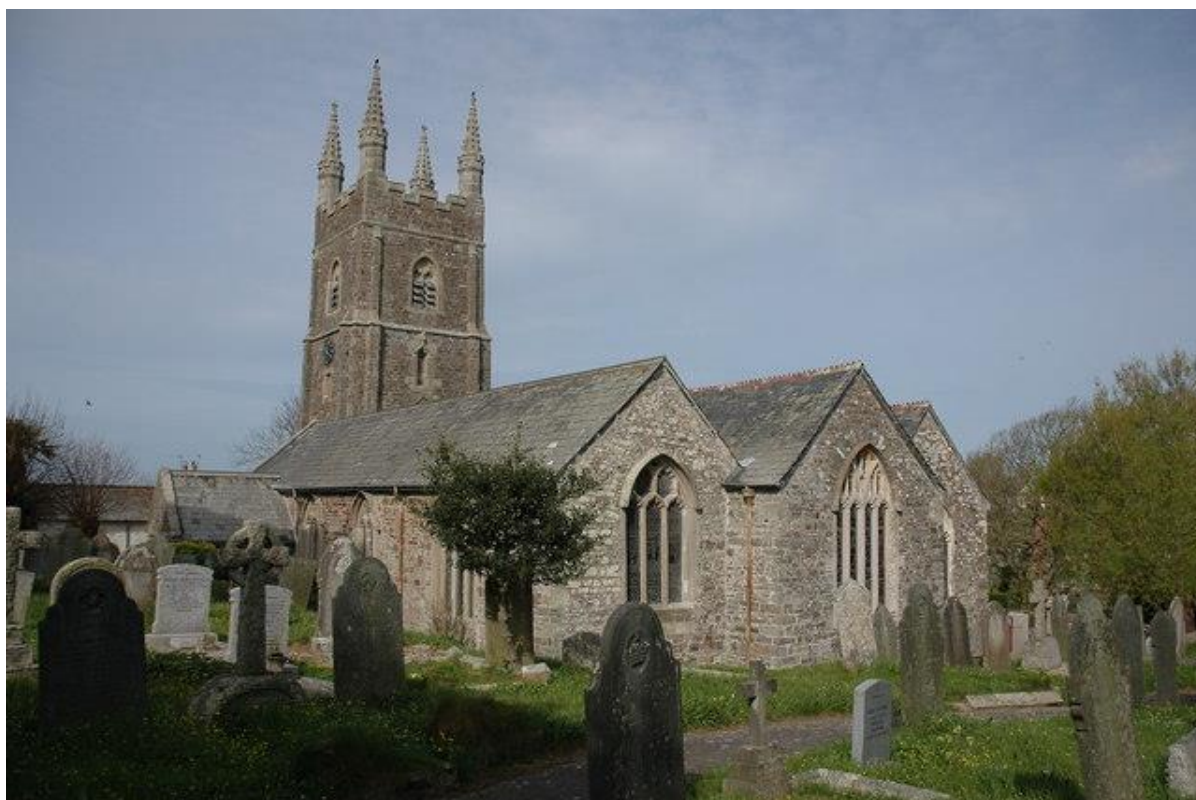
Poughill Church

St. Olaf Churchyard, Poughill contains 4 Commonwealth War Graves, 3 of them from World War 2.