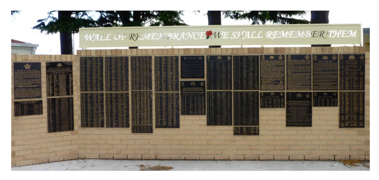
Wall of Remembrance, St. Helens, Tasmania

"What these men did nothing can alter now. The good and the bad, the greatness and the smallness of their story will stand. Whatever of glory it contains nothing now can lessen. It rises, as it will always rise, above the mists of ages, a monument to great hearted men; and for their nation, a possession forever."