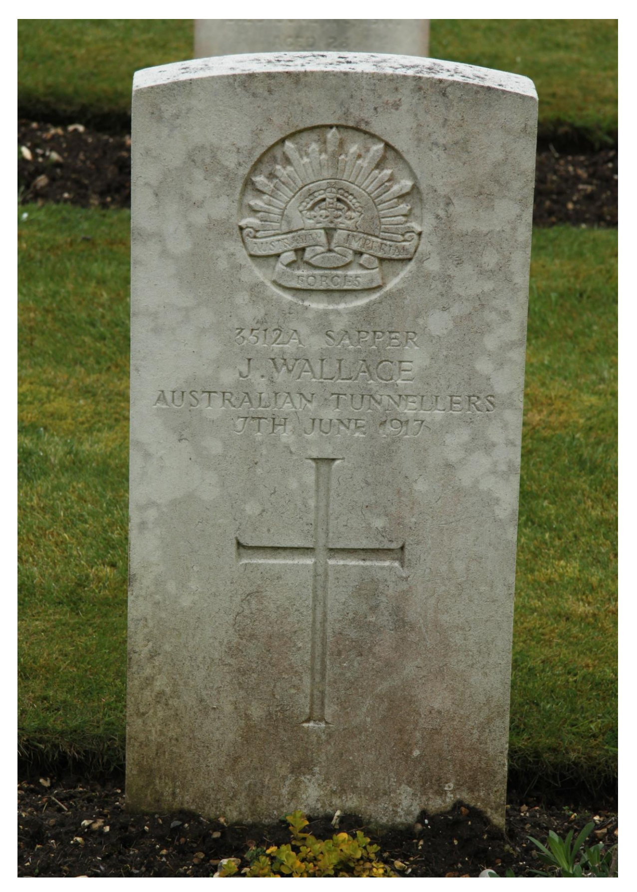
Photo of Sapper J. Wallace's Commonwealth War Graves Commission Headstone in Tidworth Military Cemetery, Wiltshire, England.