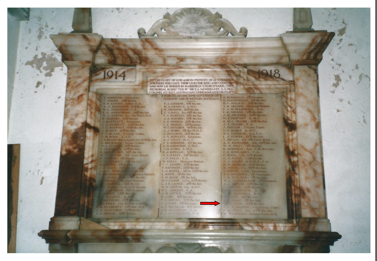
Australian Soldiers' Memorial, Harefield