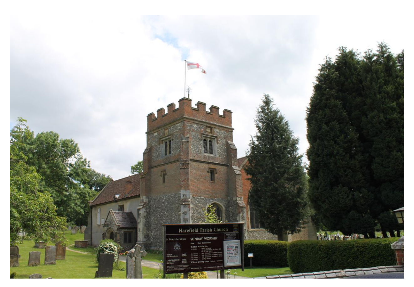
St Mary the Virgin Church, Harefield