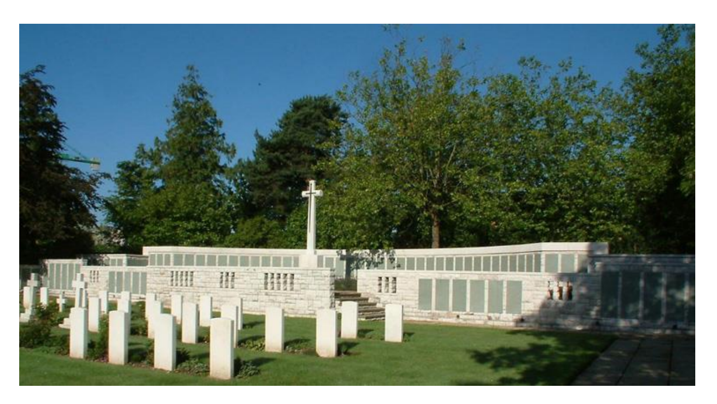
CWGC Graves in Hollybrook Cemetery with Cross of Sacrifice & Hollybrook Memorial