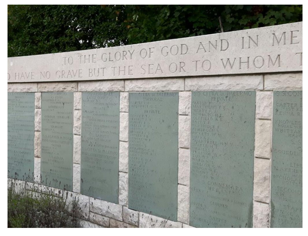
Name Panels behind Cross of Sacrifice