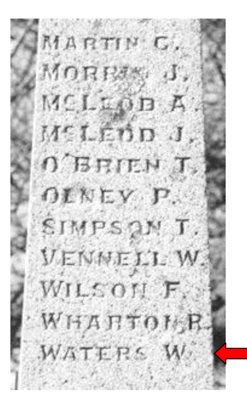
Warburton War Memorial