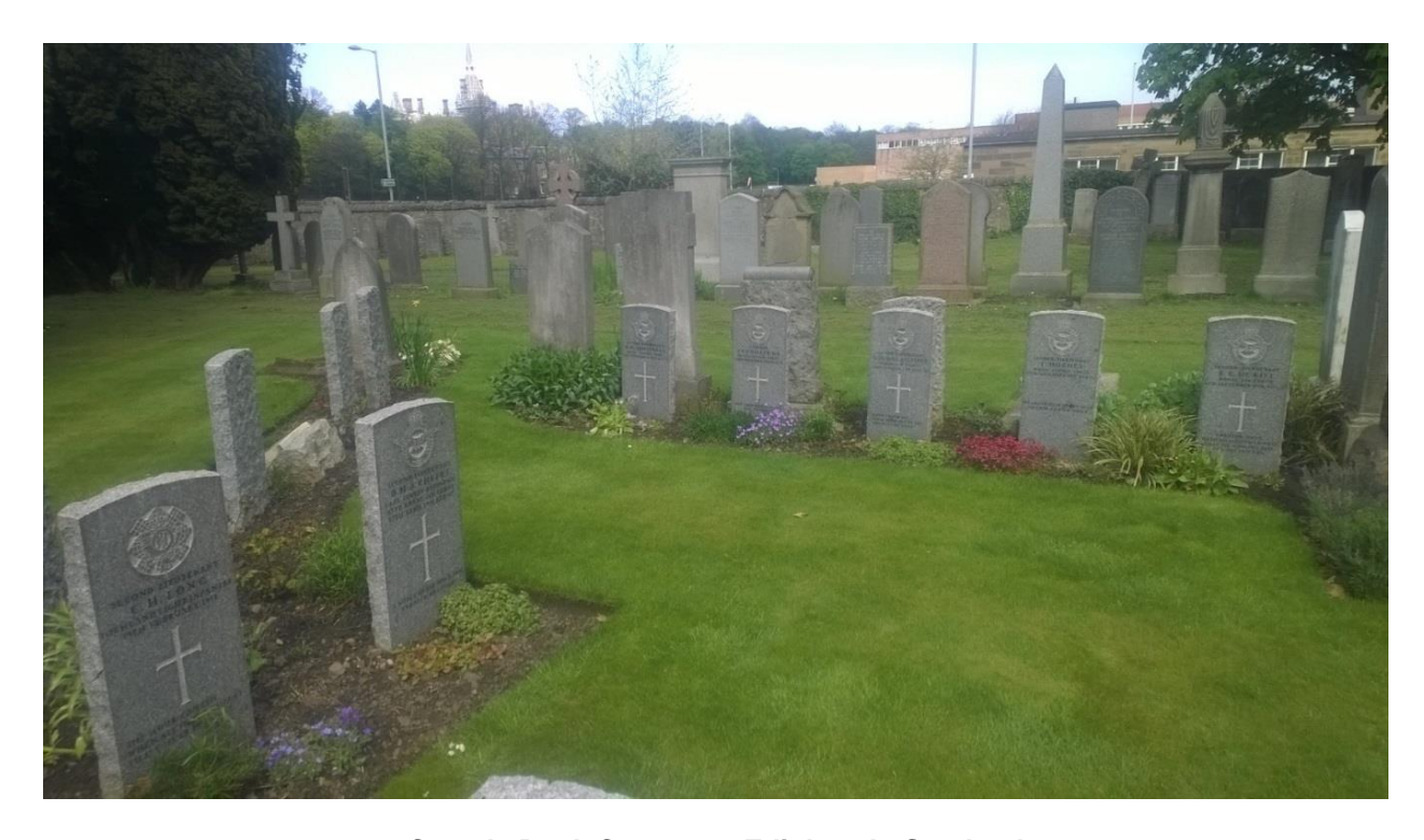
Comely Bank Cemetery, Edinburgh, Scotland