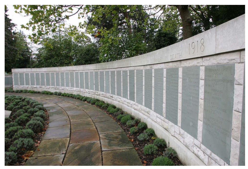
Name Panels behind Cross of Sacrifice