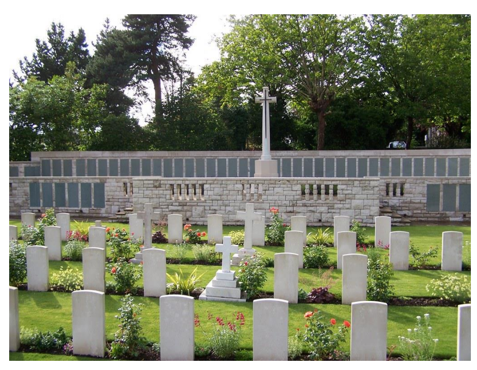
CWGC Graves in Hollybrook Cemetery with Cross of Sacrifice & Hollybrook Memorial