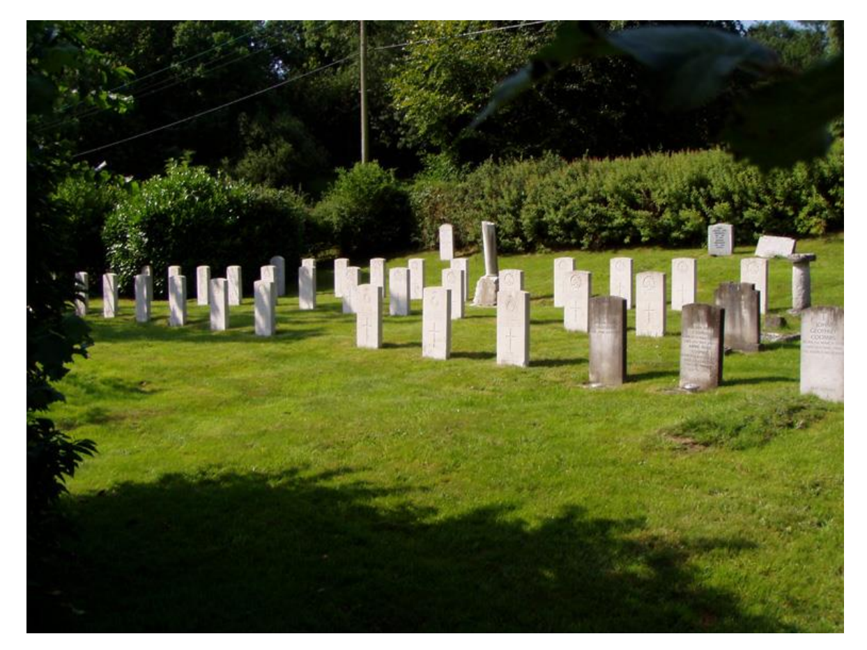
Compton Chamberlayne War Graves