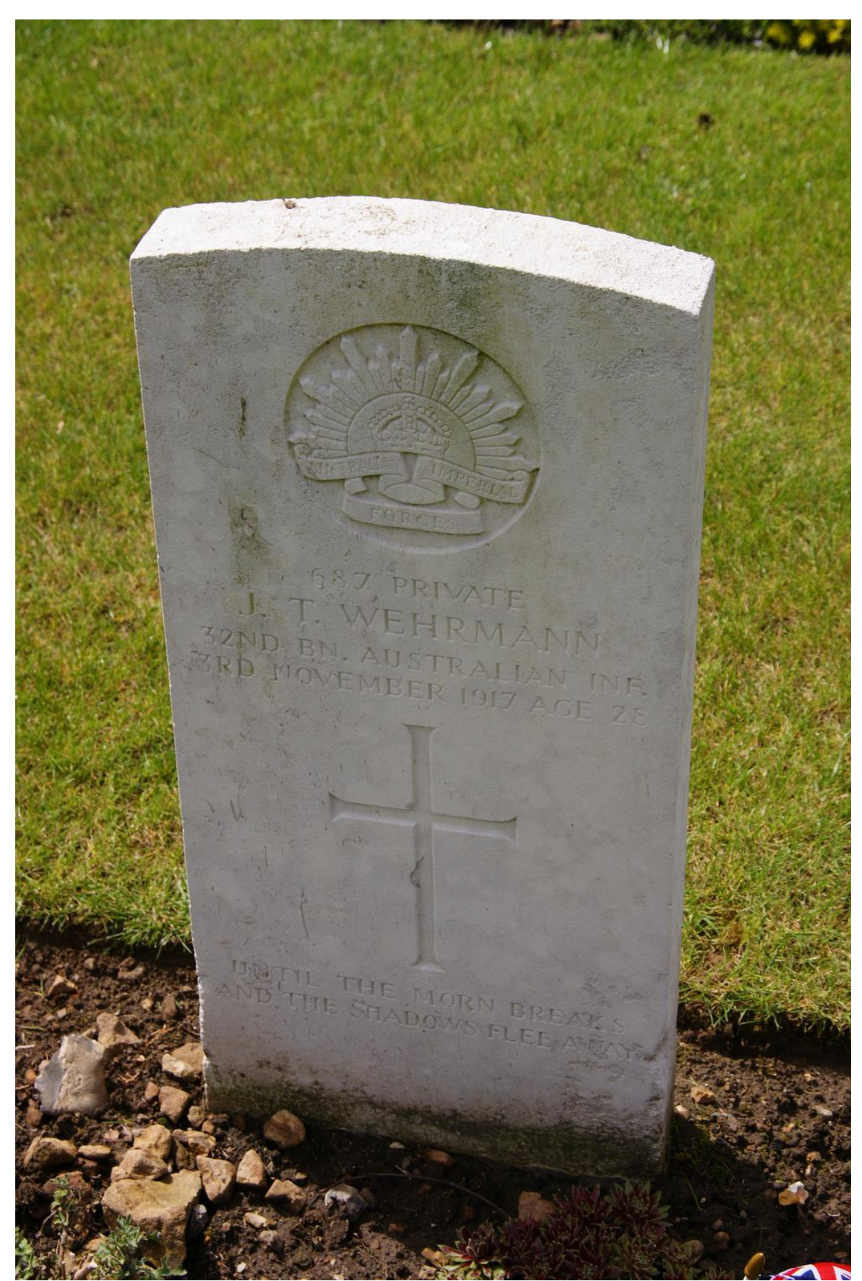
Photo of Private J. T. Wehrmann's Commonwealth War Graves Commission Headstone at Compton Chamberlayne War Graves Cemetery, Wiltshire, England.