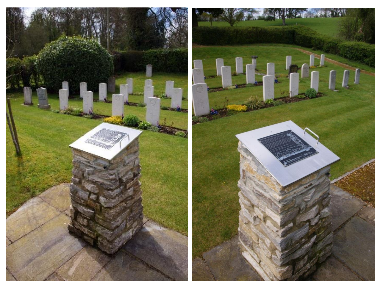
Left & right of Cemetery with central Plinth