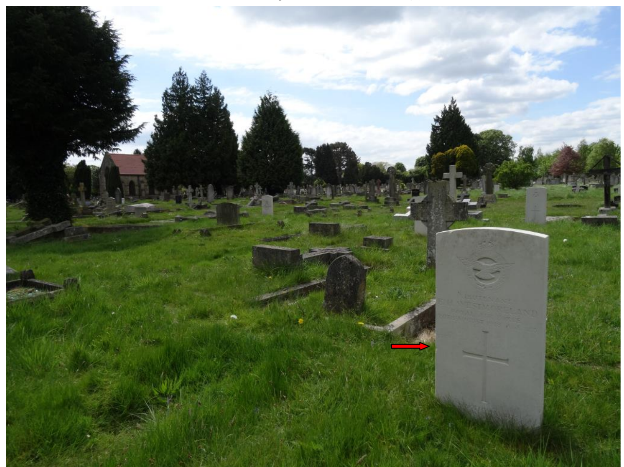
Lieutenant E. H. Westmoreland's headstone