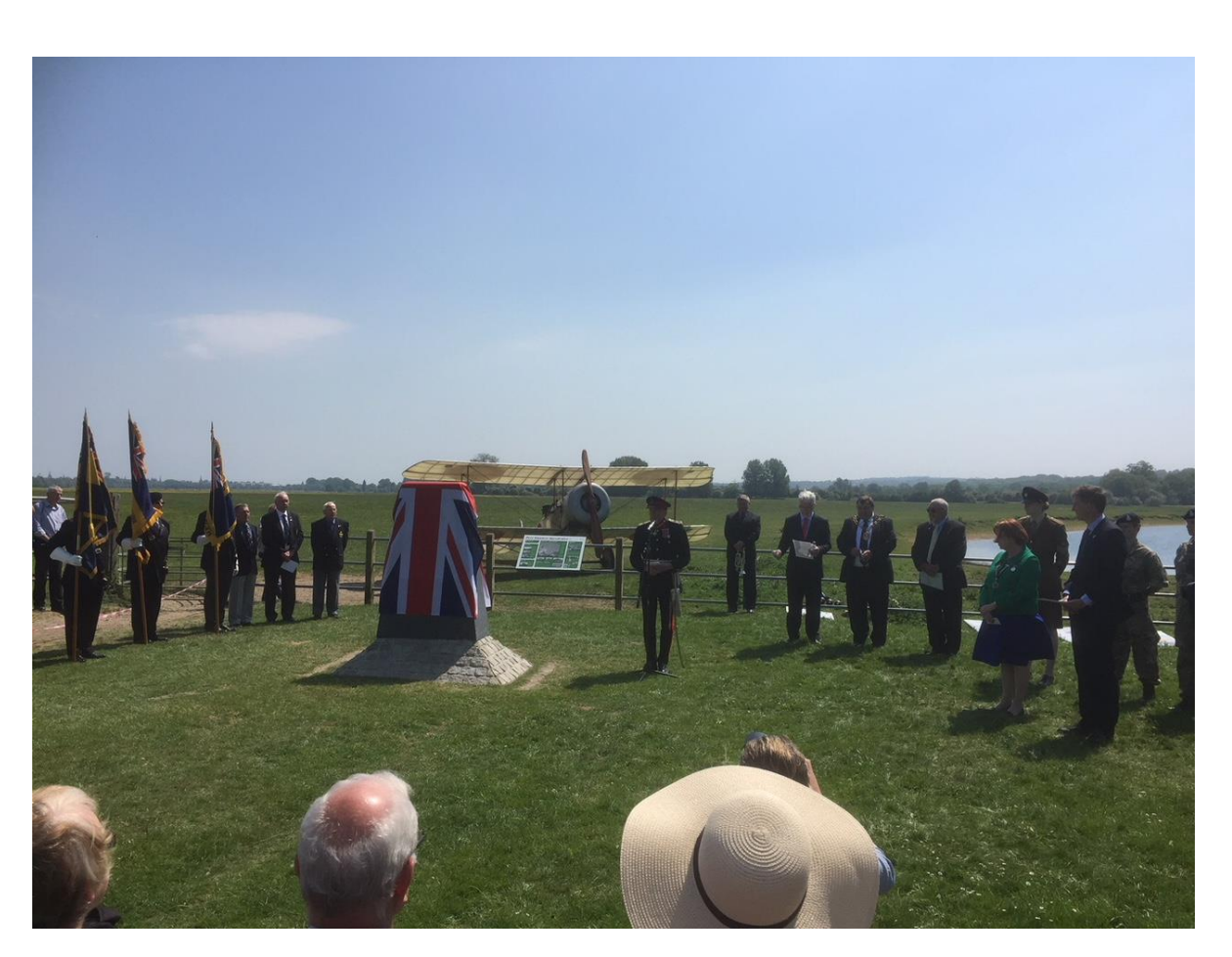
Unveiling of the Wolvercote WW1 Aerodrome Memorial – 23rd May, 2018