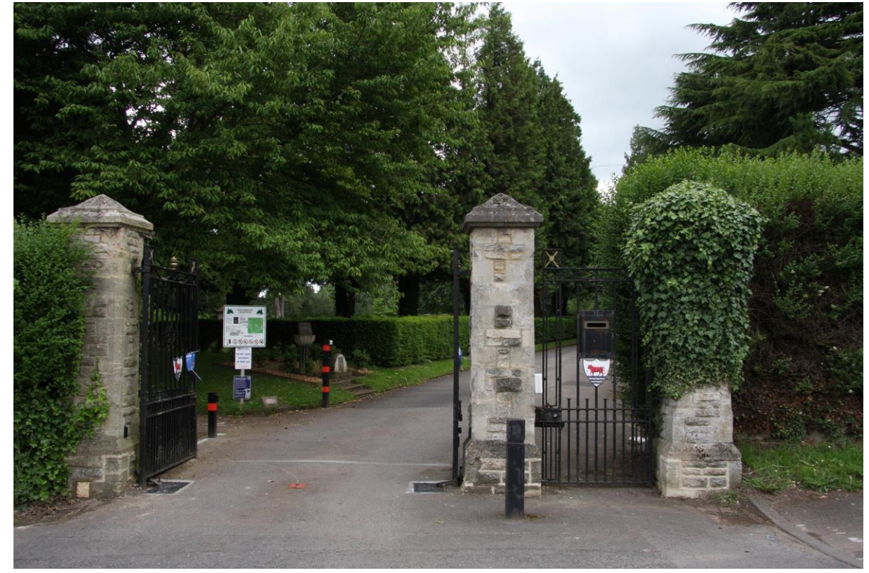
Wolvercote Cemetery, Wolvercote

Wolvercote Cemetery, Wolvercote has 45 Commonwealth War Graves – 22 from World War 1 & 23 from World War 2.