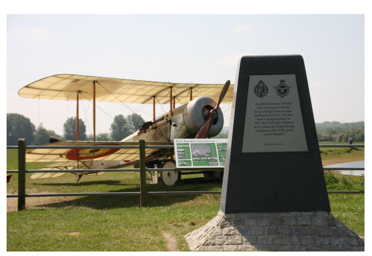
Unveiling of the Wolvercote WW1 Aerodrome Memorial - 23rd May, 2018