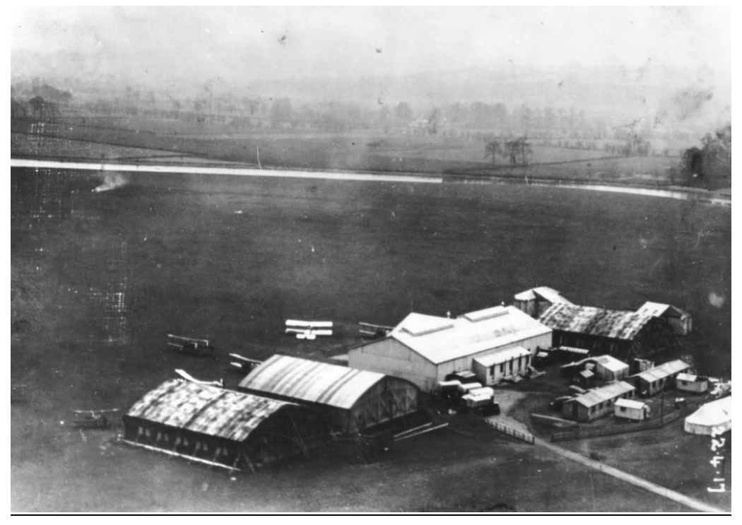
Wolvercote Aerodrome 22 April, 1917

A verdict of Accidental death was returned.