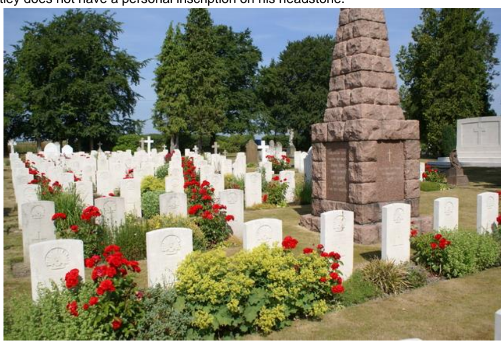
Durrington Cemetery, Wiltshire