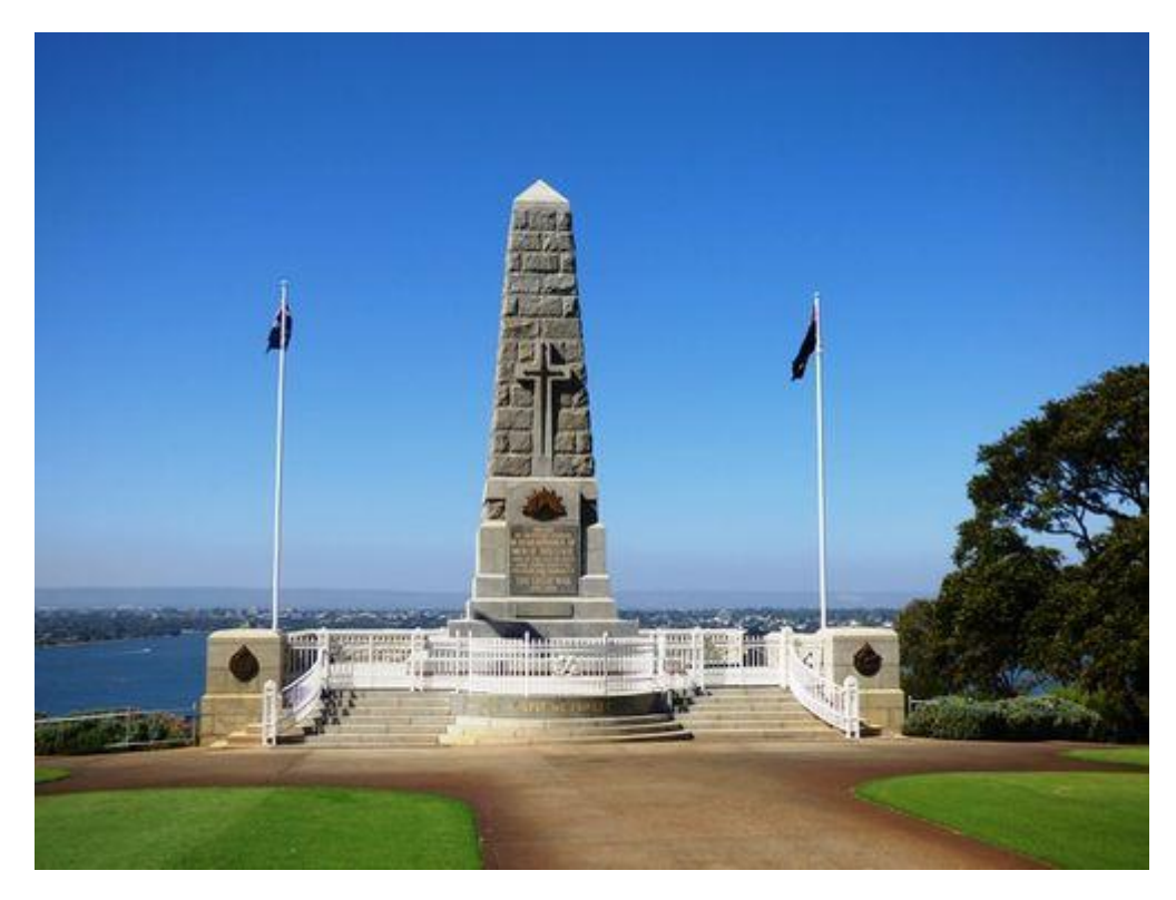
Western Australia State War Memorial Cenotaph, Kings Park (above) & (below) The Crypt with the Roll of Honour names

The heavy concrete foundations are supplemented by heavy brick walls which enclose an inner chamber or crypt. The walls surrounding the crypt are covered with The Roll of Honour; marble tablets which list under their units the names of more than 7,000 members of the services killed in action or as a result of World War One.