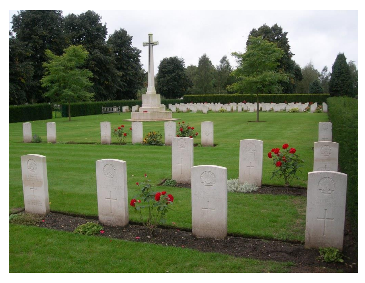
Earlham Road Cemetery