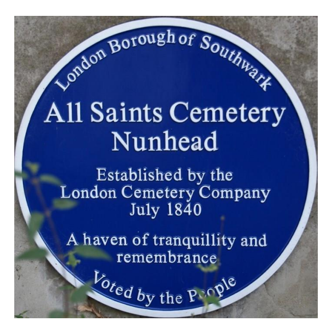
All Saints Cemetery, Nunhead

There is also 1 Belgian burial of the 1914-1918 war and 7 Non-war Service burials, all commemorated on the Screen Wall. (Information from CWGC)