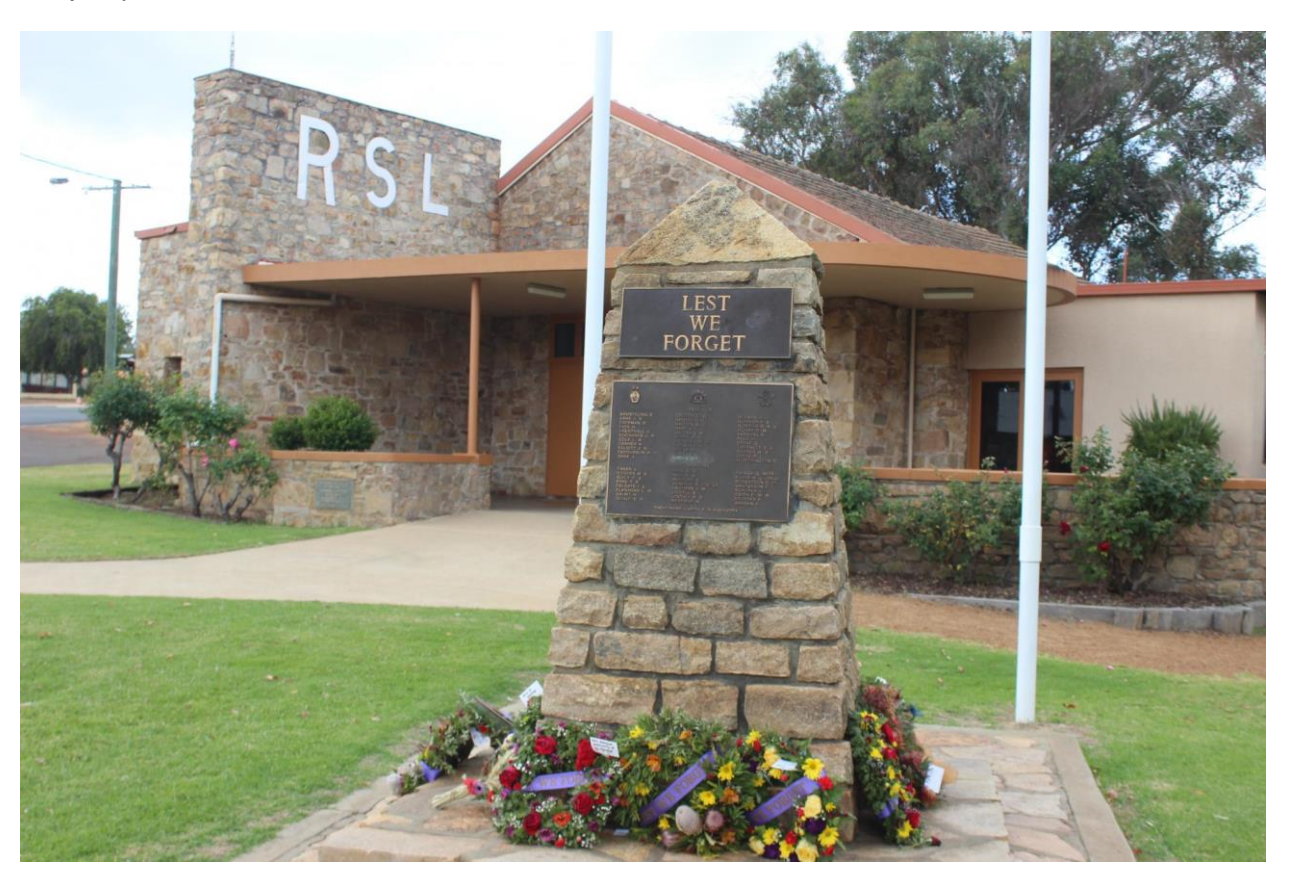
Kojonup War Memorial