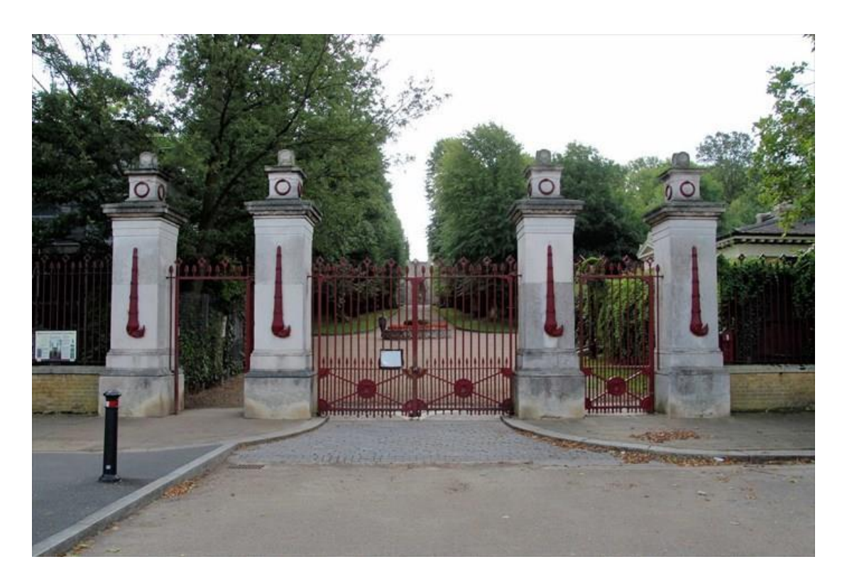
All Saints Cemetery, Nunhead