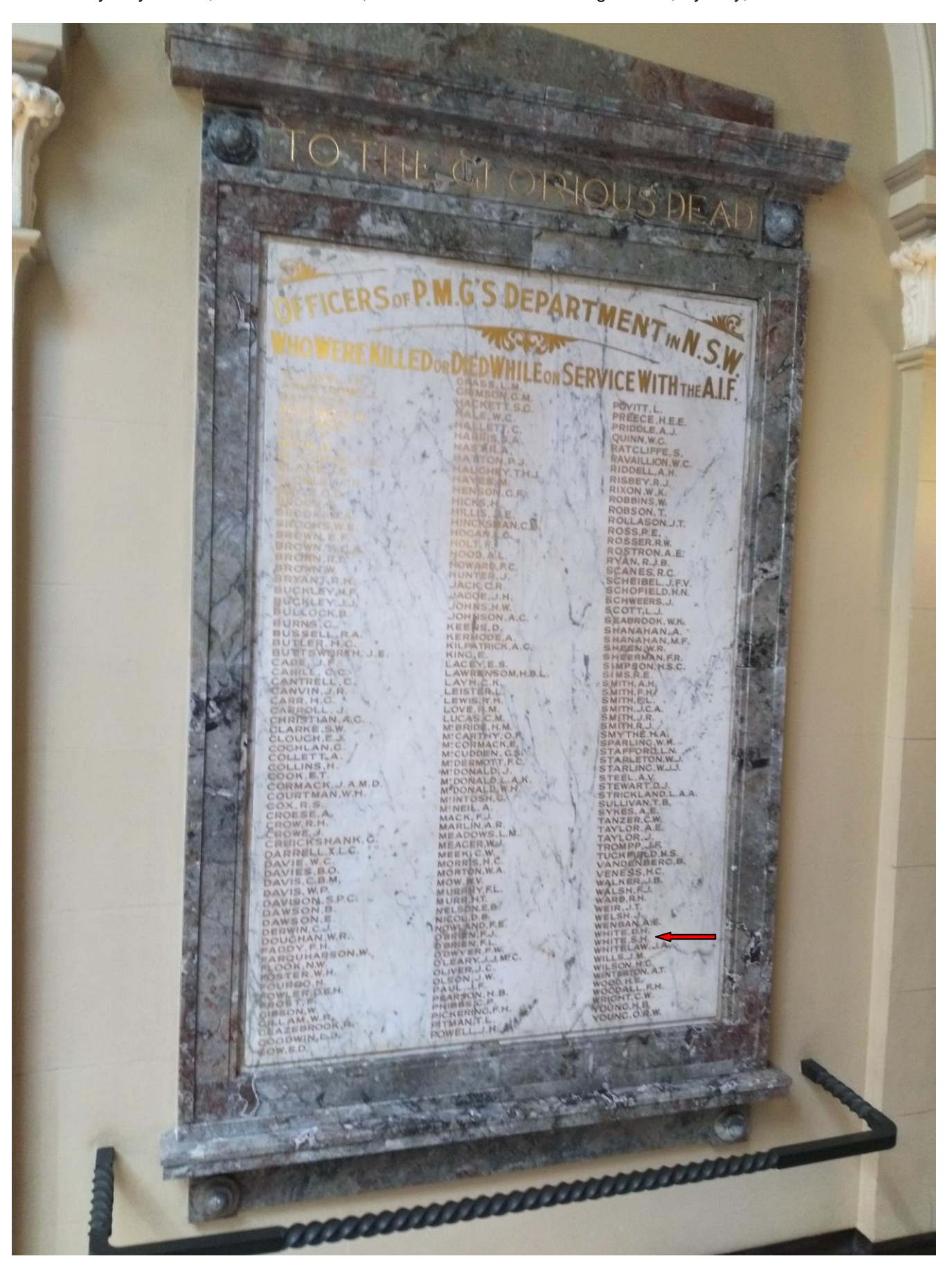
NSW Officers of the Post Master General's Department Honour Roll, Sydney