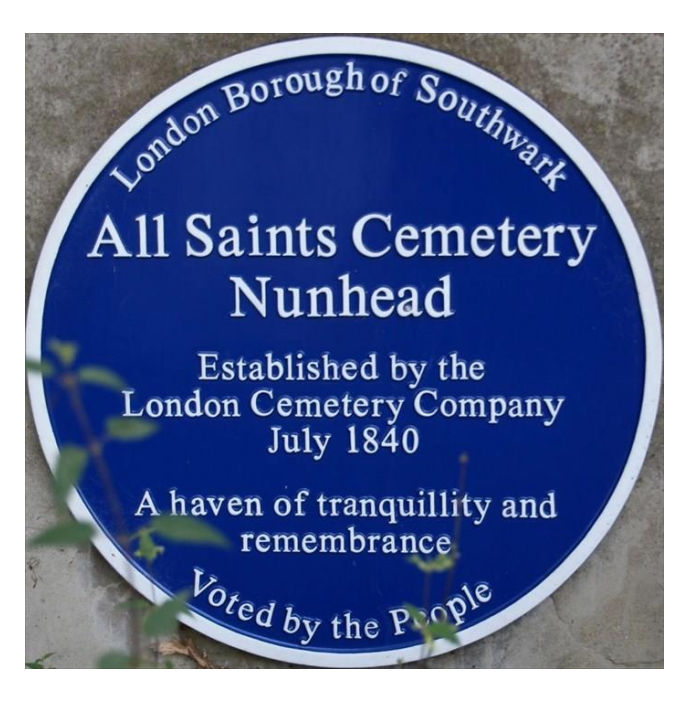
All Saints Cemetery, Nunhead

There is also 1 Belgian burial of the 1914-1918 war and 7 Non-war Service burials, all commemorated on the Screen Wall. (Information from CWGC)