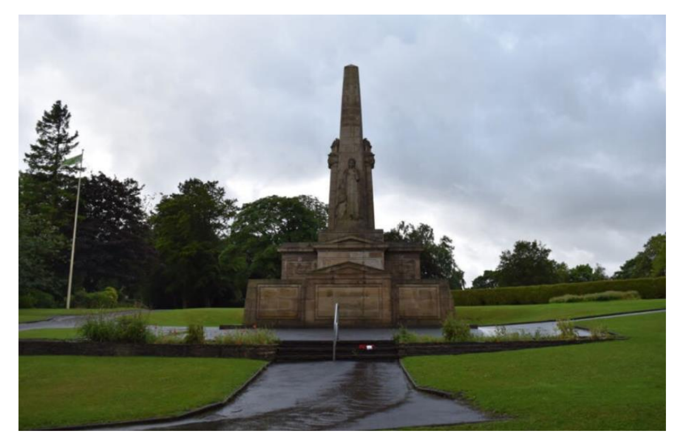
Accrington War Memorial