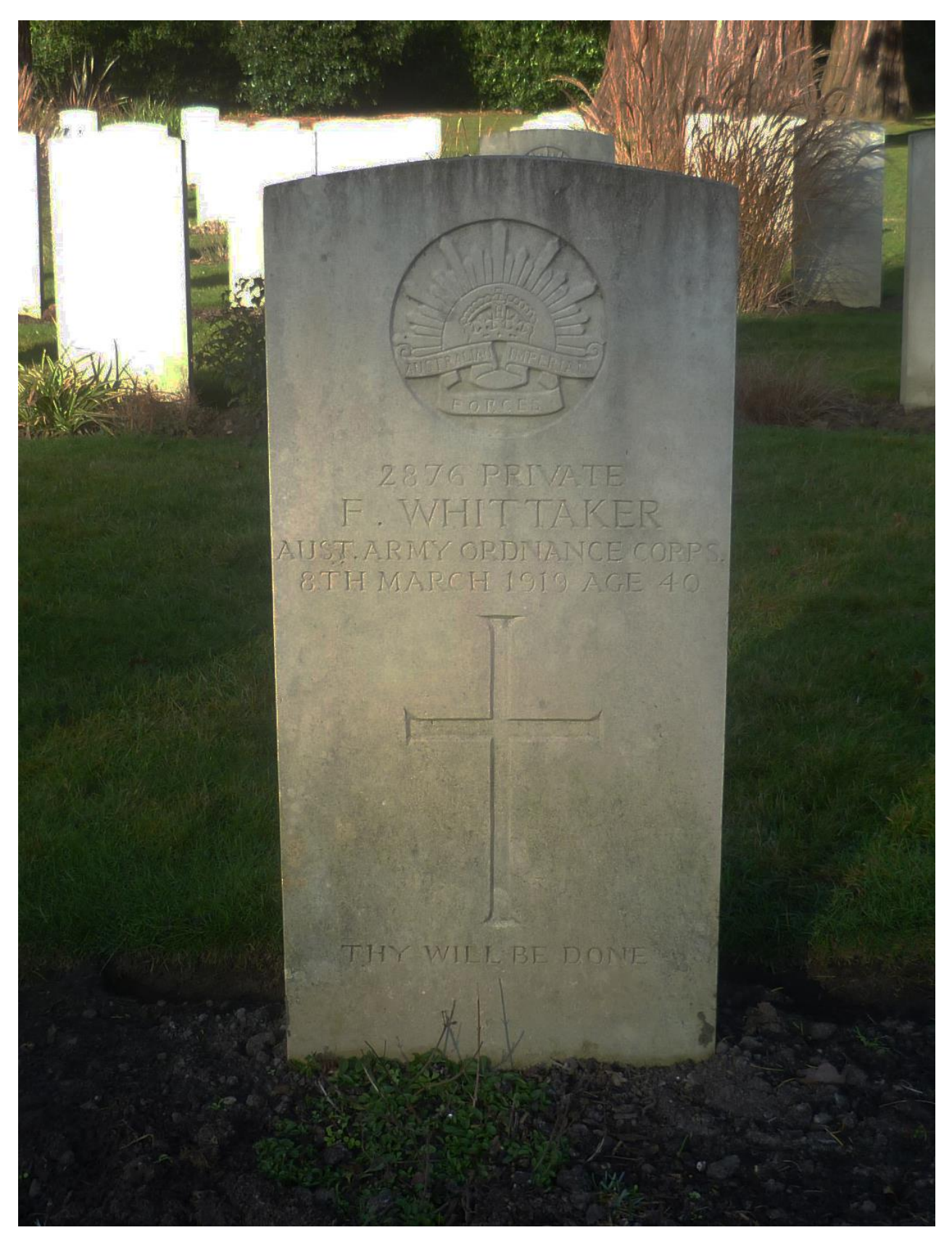
Photo of Private F. Whittaker's Commonwealth War Graves Commission Headstone in Brookwood Military Cemetery, Surrey, England.