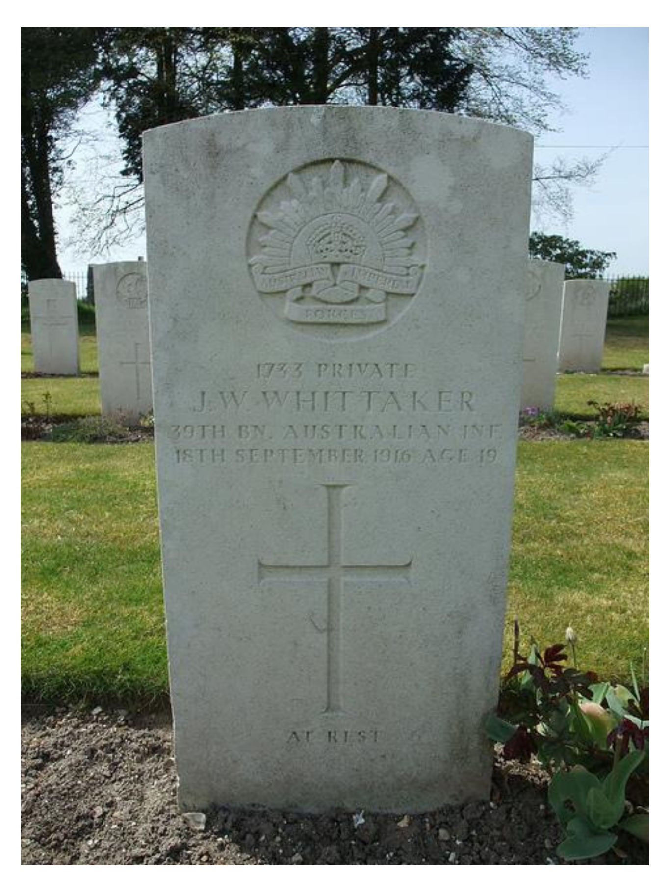
Photo of Pte J. W. Whittaker's Headstone at Durrington Cemetery, Wiltshire.