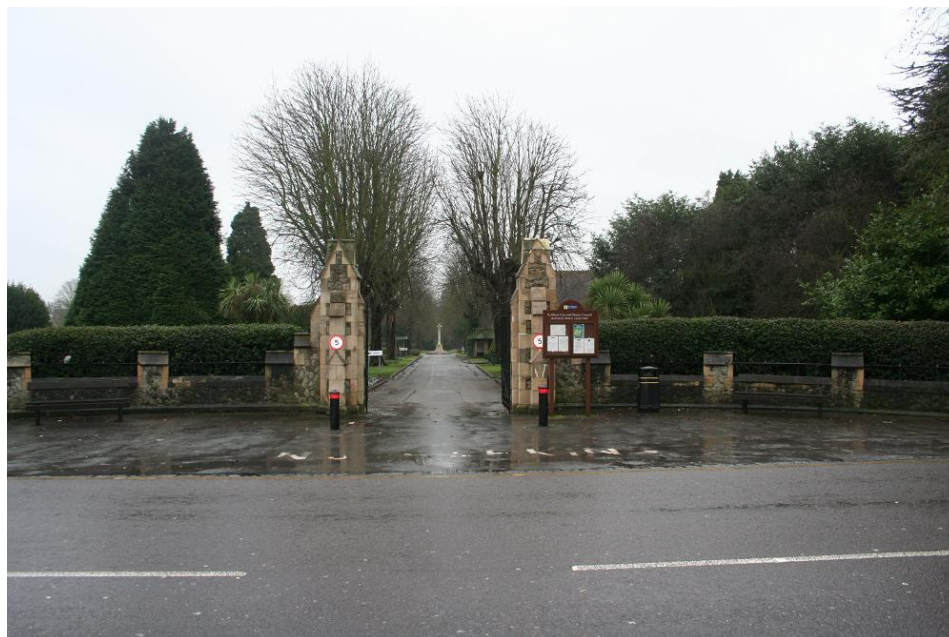
Entrance to Hatfield Road Cemetery, St. Albans