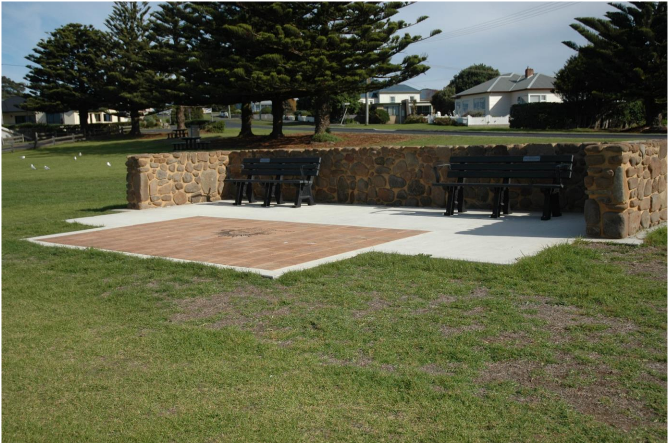
Stanley Anzac Memorial Wall