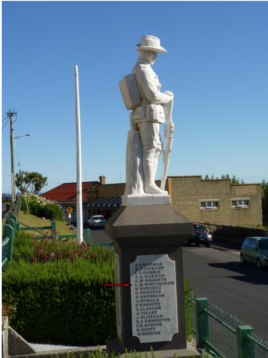
Stanley War Memorial