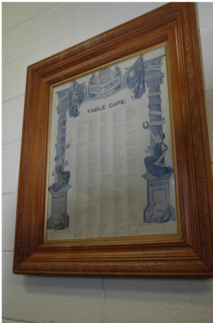
Table Cape Roll of Honour

L. W. Whittingham is remembered on the Table Cape Roll of Honour, located in Boat Harbour Primary School, 17386 Bass Highway, Boat Harbour, Tasmania.