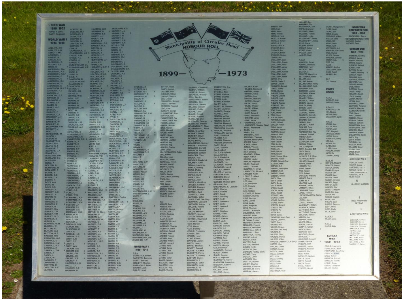
Municipality of Circular Head Honour Roll