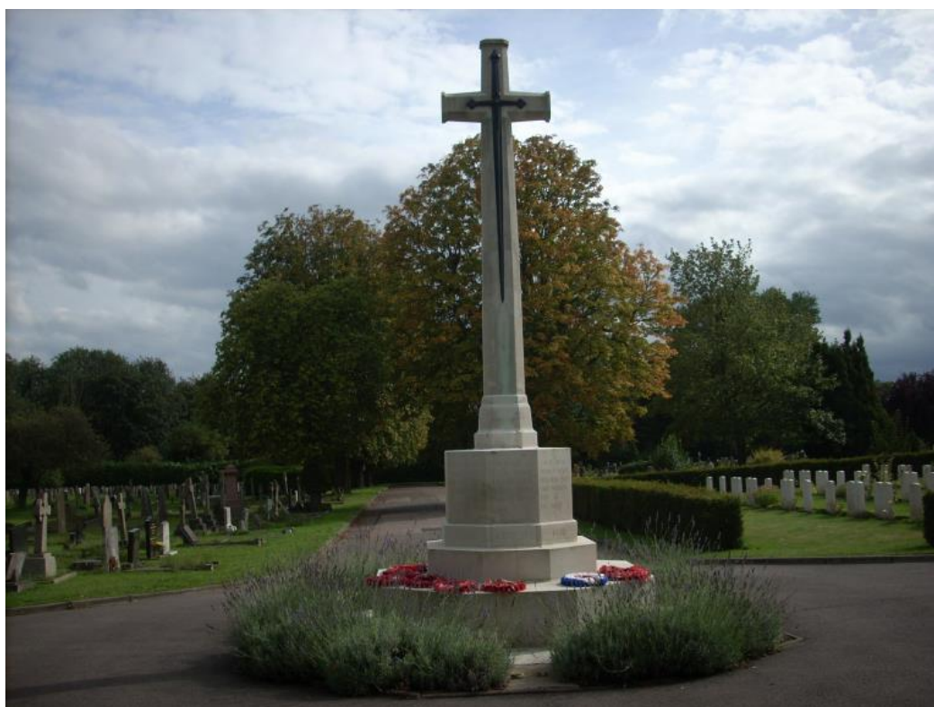
Cross of Sacrifice