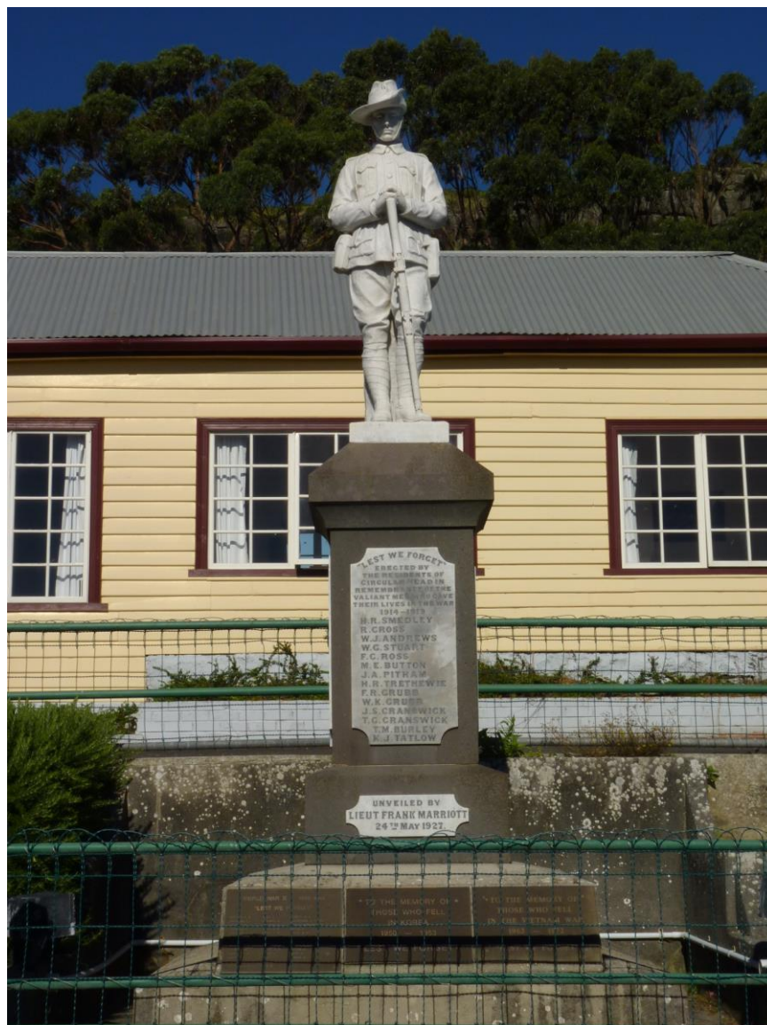
Stanley War Memorial