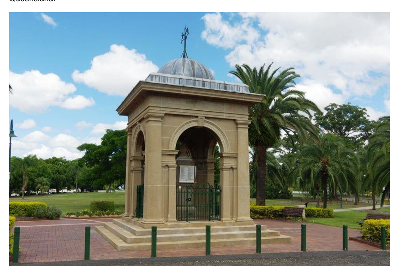
Yeronga Cenotaph/War Memorial