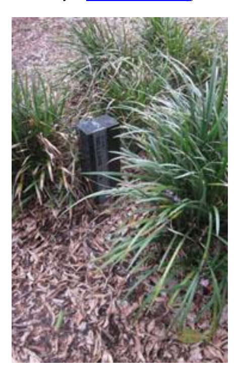
Plaque installed for Anzac Day 2012 (left) & plants with plaque in January 2015 (right)

(49 pages of Pte Robert Alfred Whitton's Service records are available for On Line viewing at National Archives of Australia website).