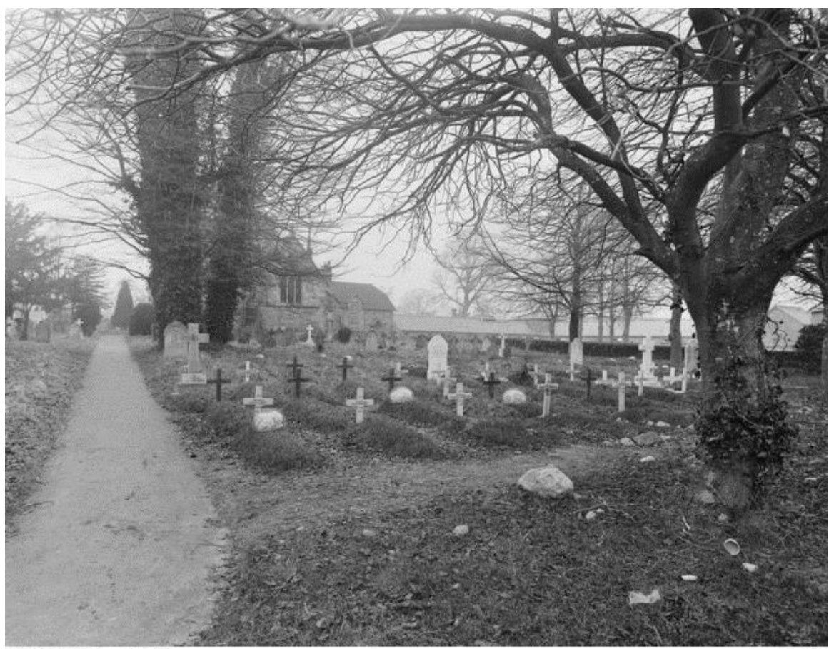
AUSTRALIAN WAR MEMORIAL D0029:

There was a 600 bed hutted military hospital at Fovant during the First World War, and the concentration of Australian depots and training camps in the area is reflected in the 63 First World War burials in this churchyard. The war graves form two groups, one west of the church and the other at the east end. There is also one burial of the Second World War. There are 44 War Graves belonging to those who served with the Australian Imperial Force in World War 1. (Information from CWGC)