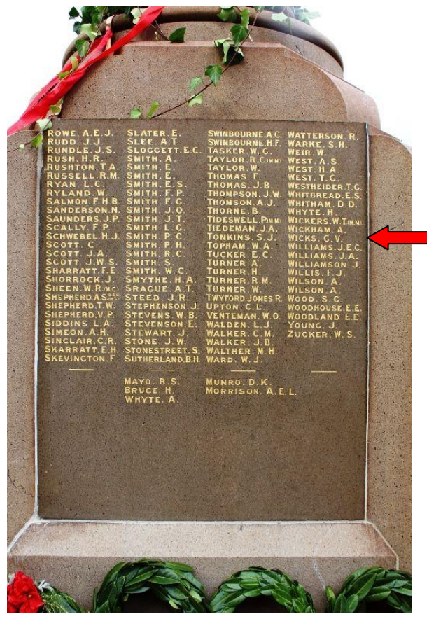
Marrickville War Memorial