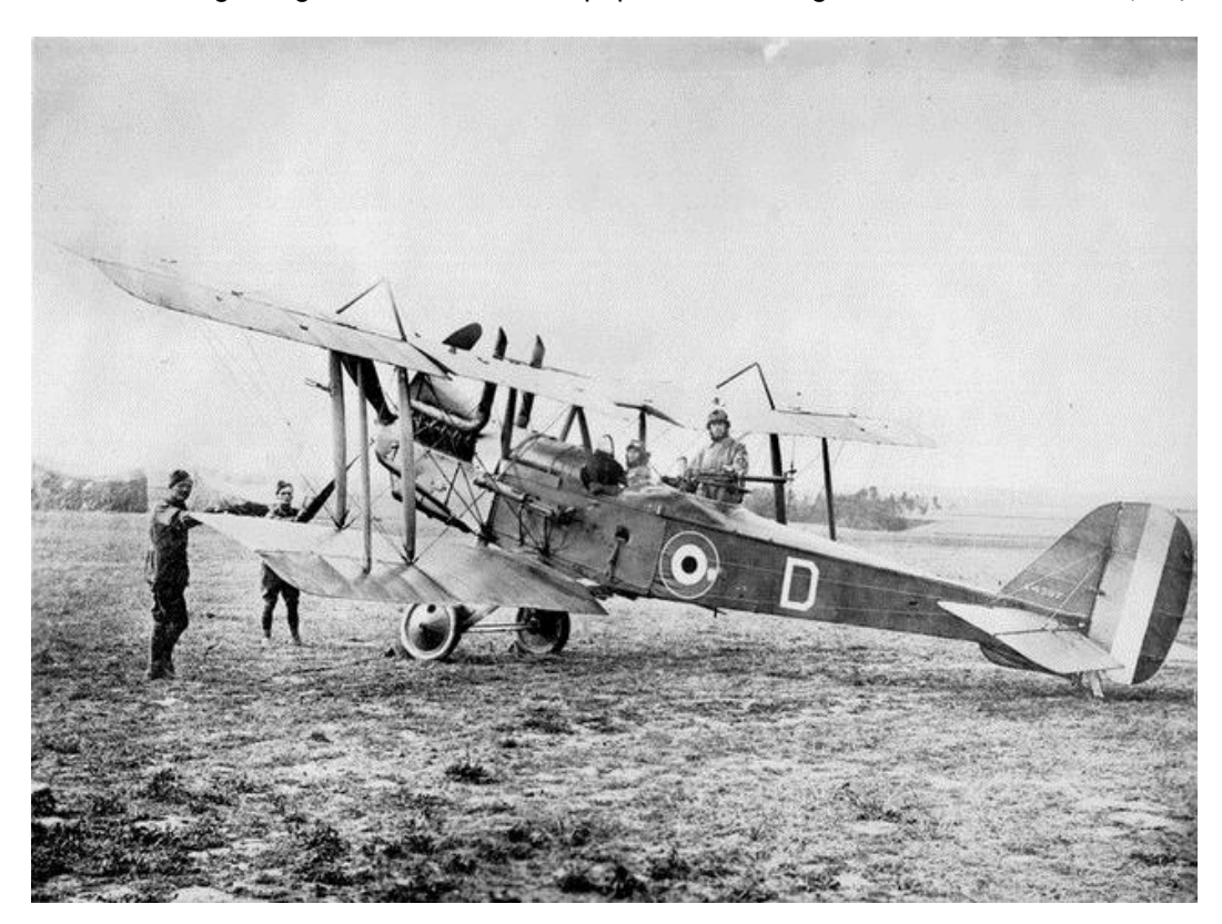
An R.E.8 aeroplane

The R.E.8 was a British two-seat biplane reconnaissance and bomber aircraft of the First World War designed at the Royal Aircraft Factory. Intended as a replacement for the vulnerable B.E.2, the R.E.8 was widely regarded as more difficult to fly and gained a reputation in the Royal Flying Corps for being "unsafe" that was never entirely dispelled. Although eventually it gave reasonably satisfactory service, it was never an outstanding combat aircraft. In spite of this, the R.E.8 served as the standard British reconnaissance and artillery observation aircraft from mid-1917 to the end of the war, serving alongside the rather more popular Armstrong Whitworth F.K.8. (Wikipedia)