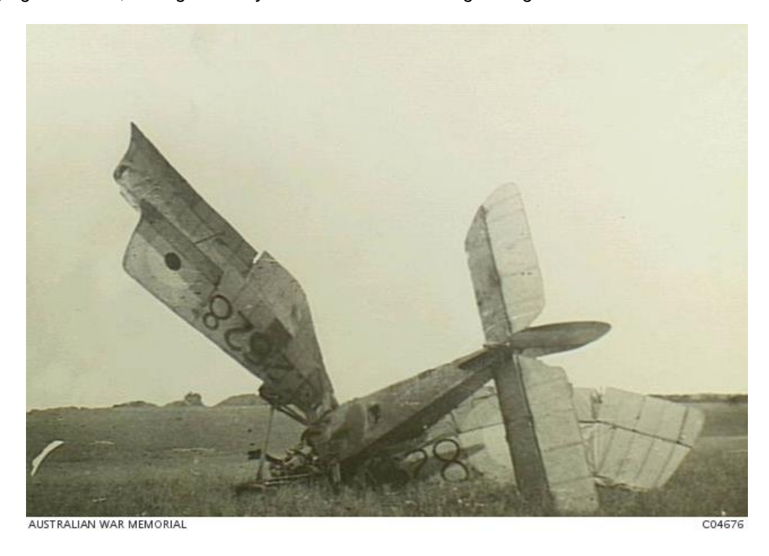
Crashed R.E.8 C/2628 piloted by Second Lieutenant George Viner Wicks

The scene of the accident was visited before the aeroplane was removed with the following findings: "The Aeroplane was found lying on its side, having evidently fallen on its nose and right wing. The rudder controls were intact."