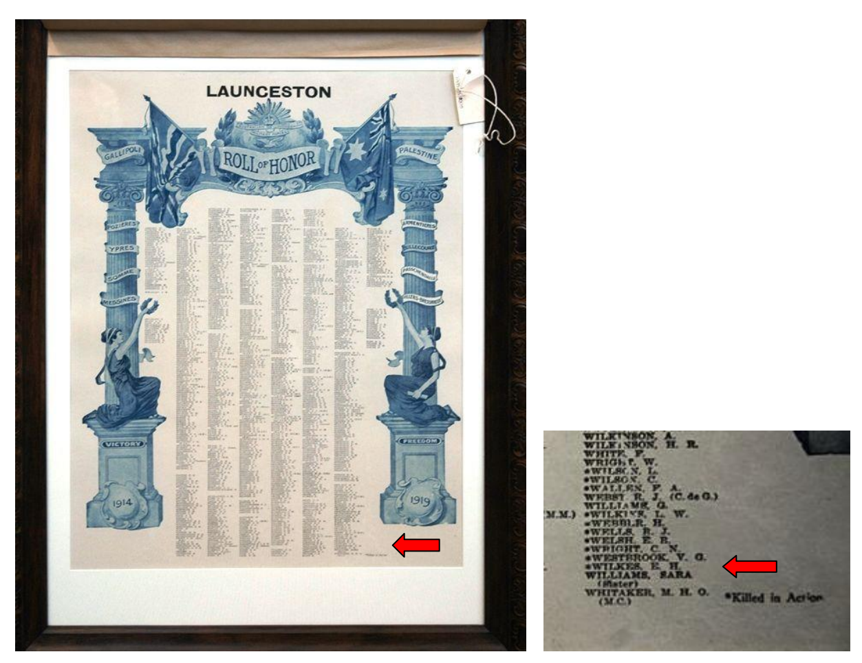
Launceston Roll of Honour