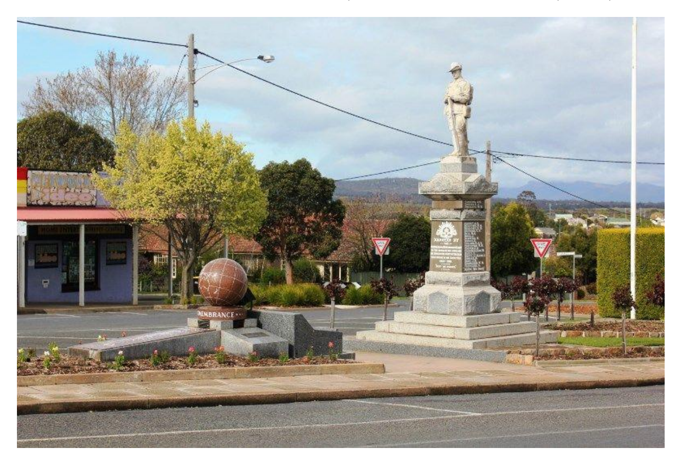
Stawell War Memorial