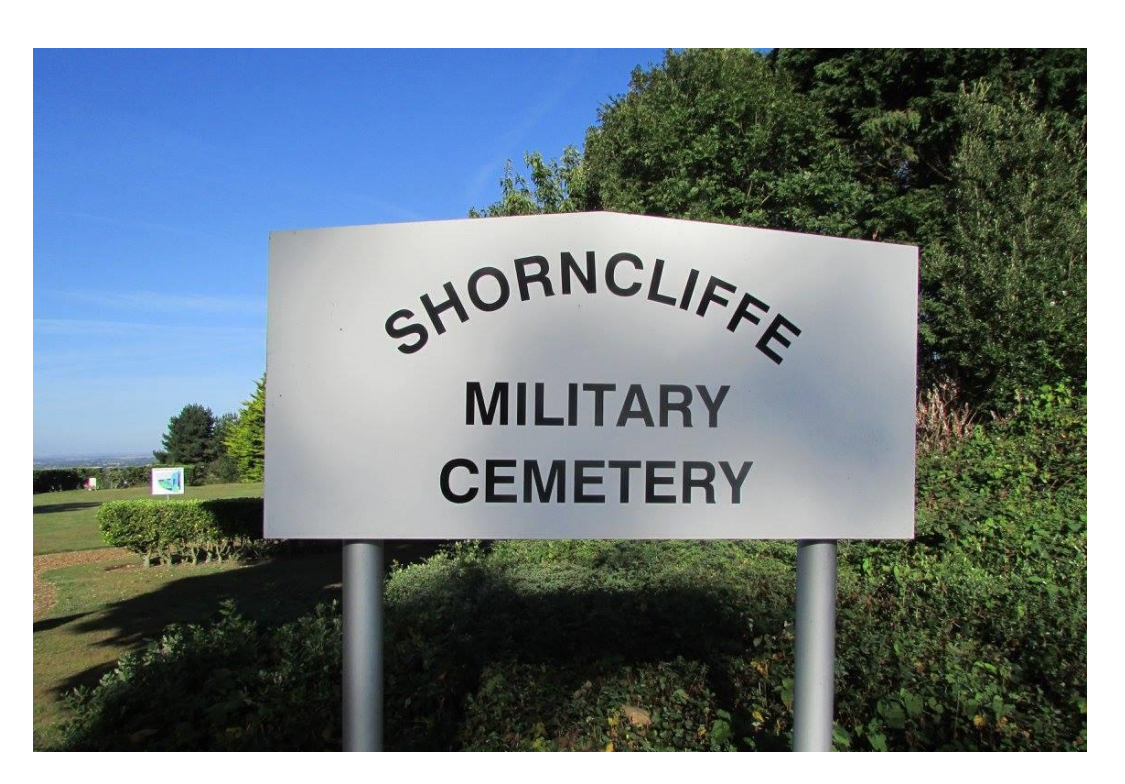
Shorncliffe Military Cemetery, Folkestone