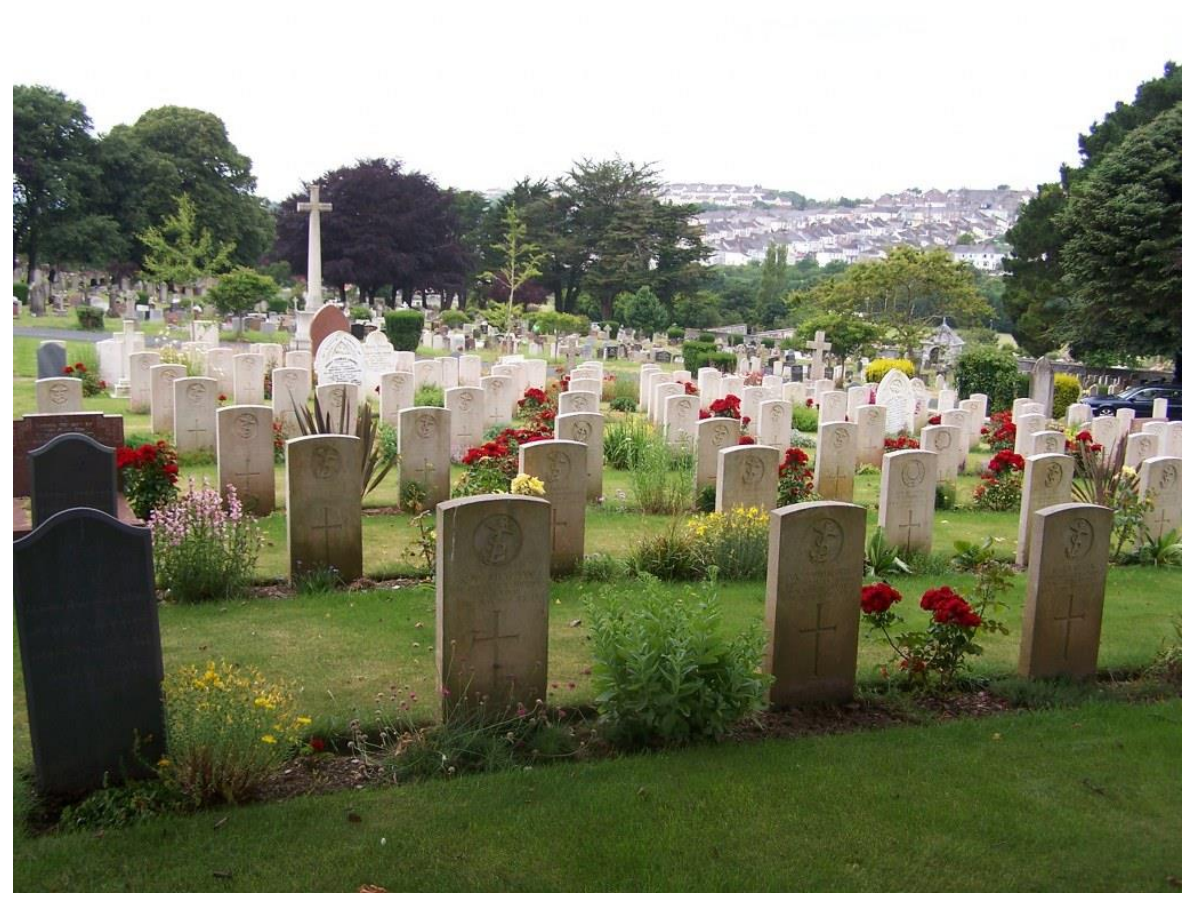
Weston Mill Cemetery, Plymouth, Devon