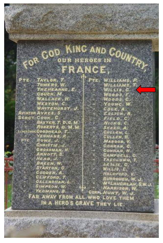
Lithgow War Memorial