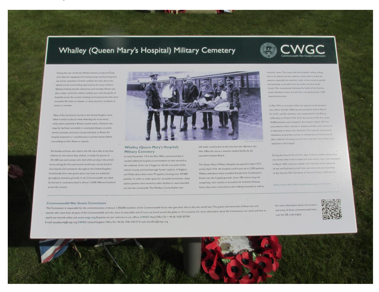
Queen Mary's Hospital Military Cemetery, Whalley