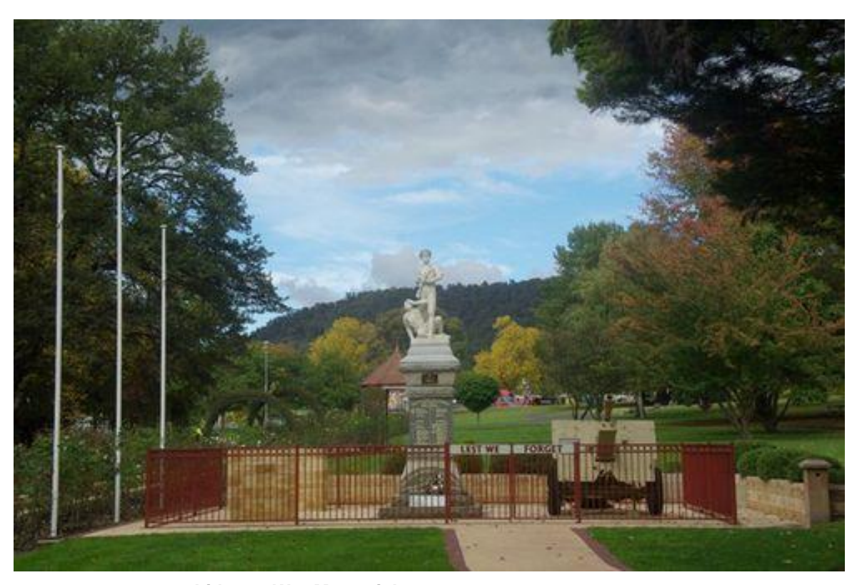
Lithgow War Memorial