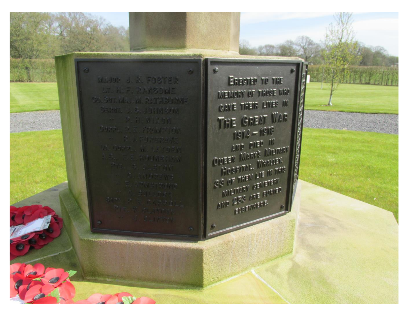
Queen Mary's Hospital Military Cemetery, Whalley