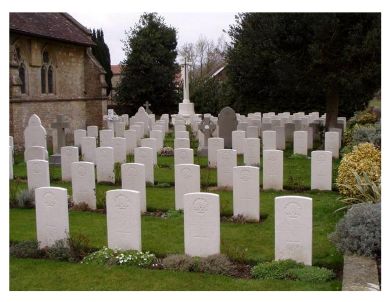
War Graves at Sutton Veny